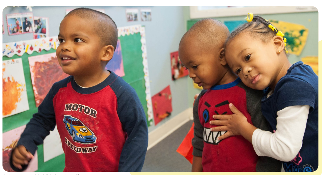
A three year old child showing affection.

This Implementation Guide will describe the process step-by-step and offer tools and other resources to help.