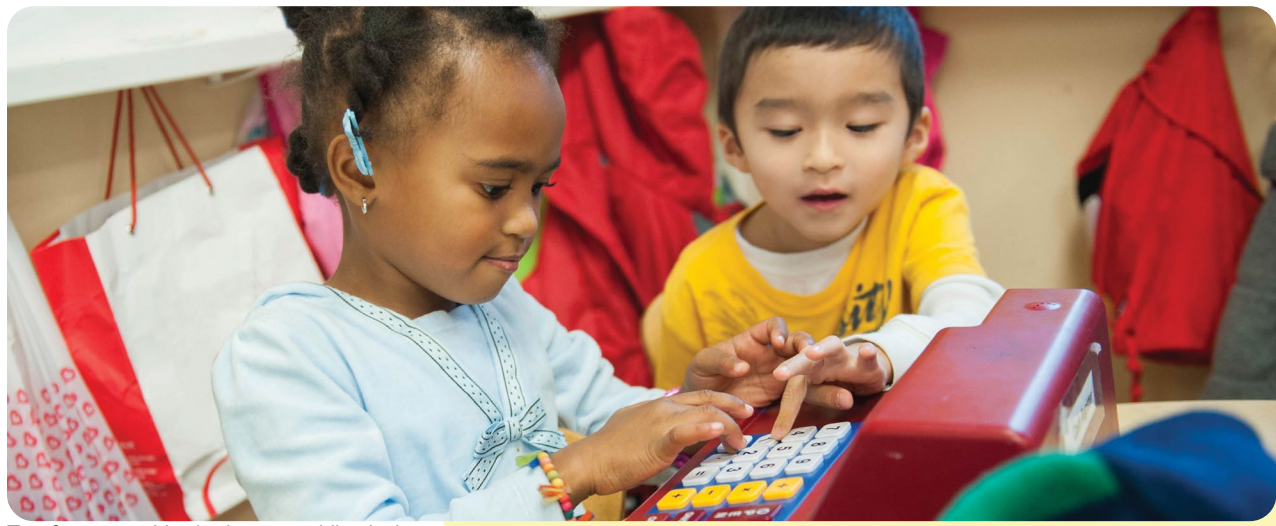
Two four-year-olds sharing toys while playing.

To help staff feel more confident, you can encourage them to take the <u>Introduction to Child Development for WIC Staff training module.</u>