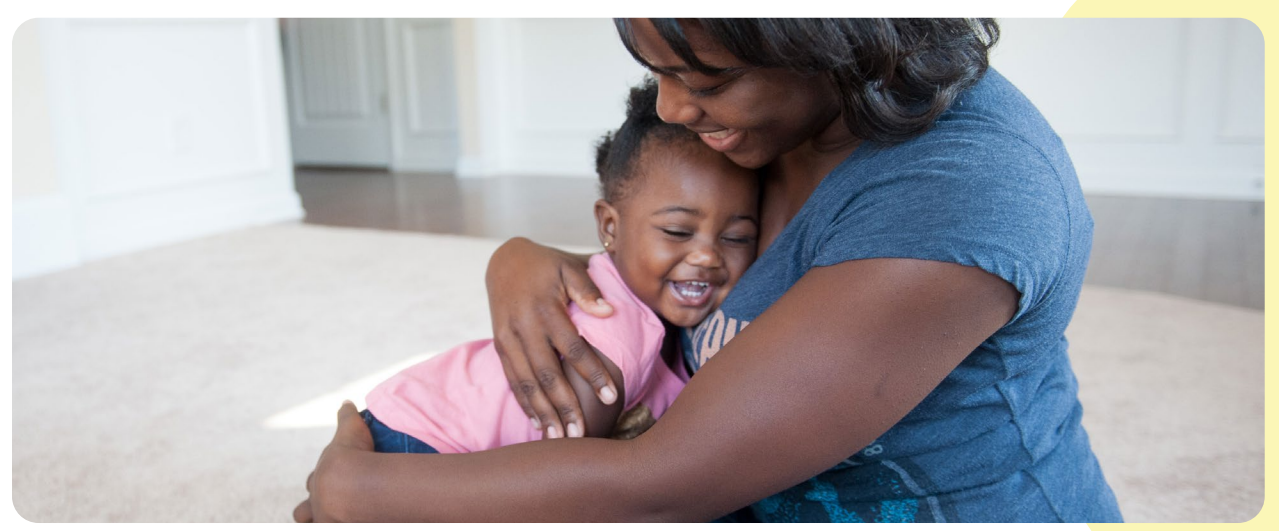
Mother huggging her 18 month old daughter.