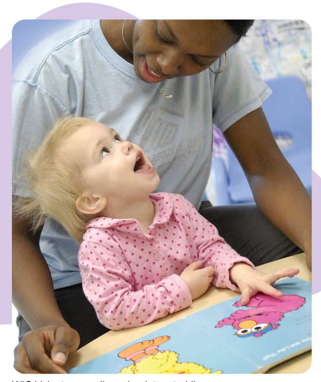
WIC Volunteer reading a book to a toddler.

Work done in Missouri has shown that the WIC Milestone Checklist Program using Learn the Signs. Act Early . materials can improve developmental monitoring of young children and help identify children that would benefit from early intervention services and support.