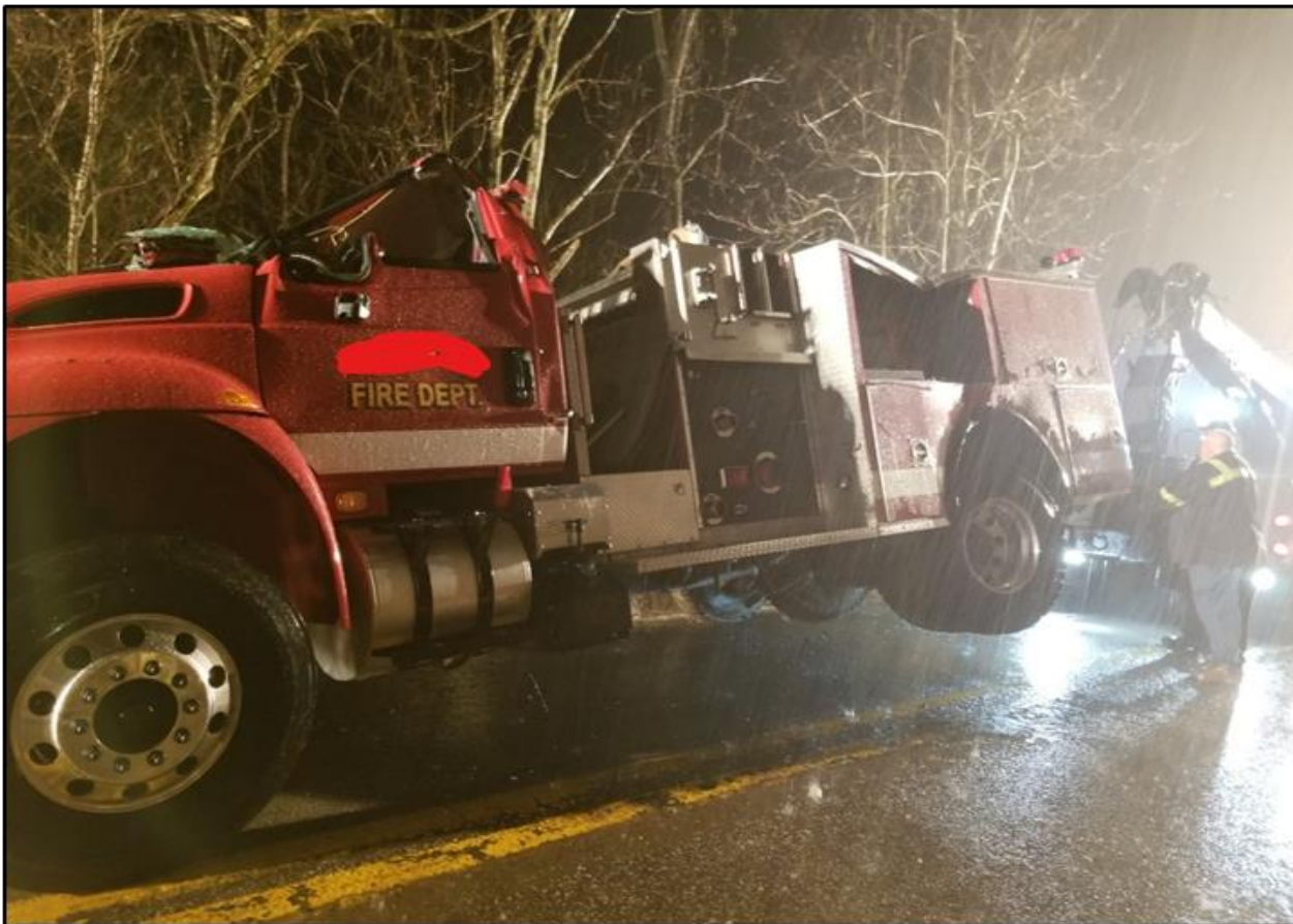
Photo 3. Engine 22 righted onto the roadway after the deceased firefighter was removed. Rain was falling at the time of this photograph, about 2 to 3 hours after the crash.

The incident occurred on a dry, level, two-lane asphalt road divided by a double yellow line. Where the crash occurred, the roadway had a slight left curve and had a width of approximately 18 feet. At the time of this incident (about 1524 hours), the weather was clear with a high of 80 degrees Fahrenheit with no precipitation [Weather Underground 2022]. The roadway was dry, however, rains over the previous days made the shoulder soft. During recovery efforts (approximately 1630 to 1730 hours), rain began to fall (Photo 3).