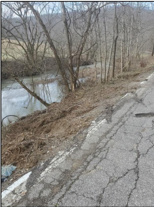
Photo 4. Gouges in the asphalt where the engine left the shoulder of the roadway. (NIOSH photo)

On January 11, 2020, a 51-year-old male volunteer firefighter reported to his fire station to drive Engine 22 to a residential structure fire. Approximately 18 miles from the station and ½ mile from the reported structure fire, the rear passenger side tires went off the pavement onto a soft shoulder/berm. The engine travelled approximately 70 feet with the right rear passenger tires on the shoulder/berm when the right rear tires hit a large boulder. The boulder was located about 3 feet off the roadway. The impact dislodged Engine 22's rear axle causing the driver to lose control of the engine. Tire skid marks show the vehicle returned to the roadway and crossed the double yellow line as it rotated 180 degrees. Approximately 120 feet from the initial impact of the boulder, Engine 22 exited the left side of the roadway (Photo 4). At this point the engine began to roll on its longitudinal axis down an embankment landing on its roof (Photo 5). The engine was dangerously balancing on a tree that prevented it from cascading farther down the hill to the creek below (Photo 5).