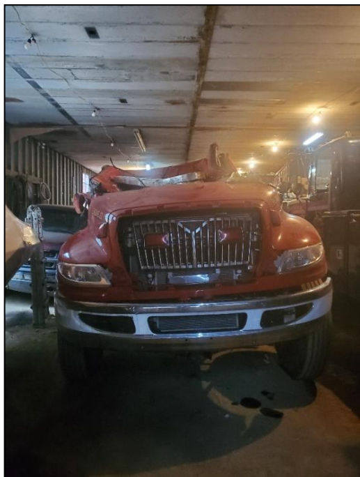
Photo 1. Damage to the front of Engine 22 stored at the wrecking/salvage yard.

Minor fleet maintenance is performed by the members of the department who also complete monthly apparatus maintenance checklists on each apparatus. Other apparatus maintenance is conducted by a garage with certified heavy-equipment mechanics. Engine 22 was last serviced in July 2019.