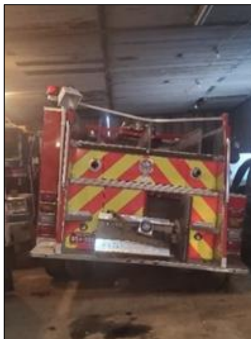
Photo 2. Damage to the rear of Engine 22 stored at the wrecking/salvage yard.