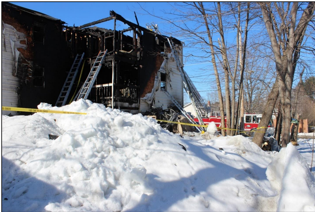
Photo 4. Ground ladders extended to a 3 rd floor porch where the captain and firefighter 1 were removed from the structure.