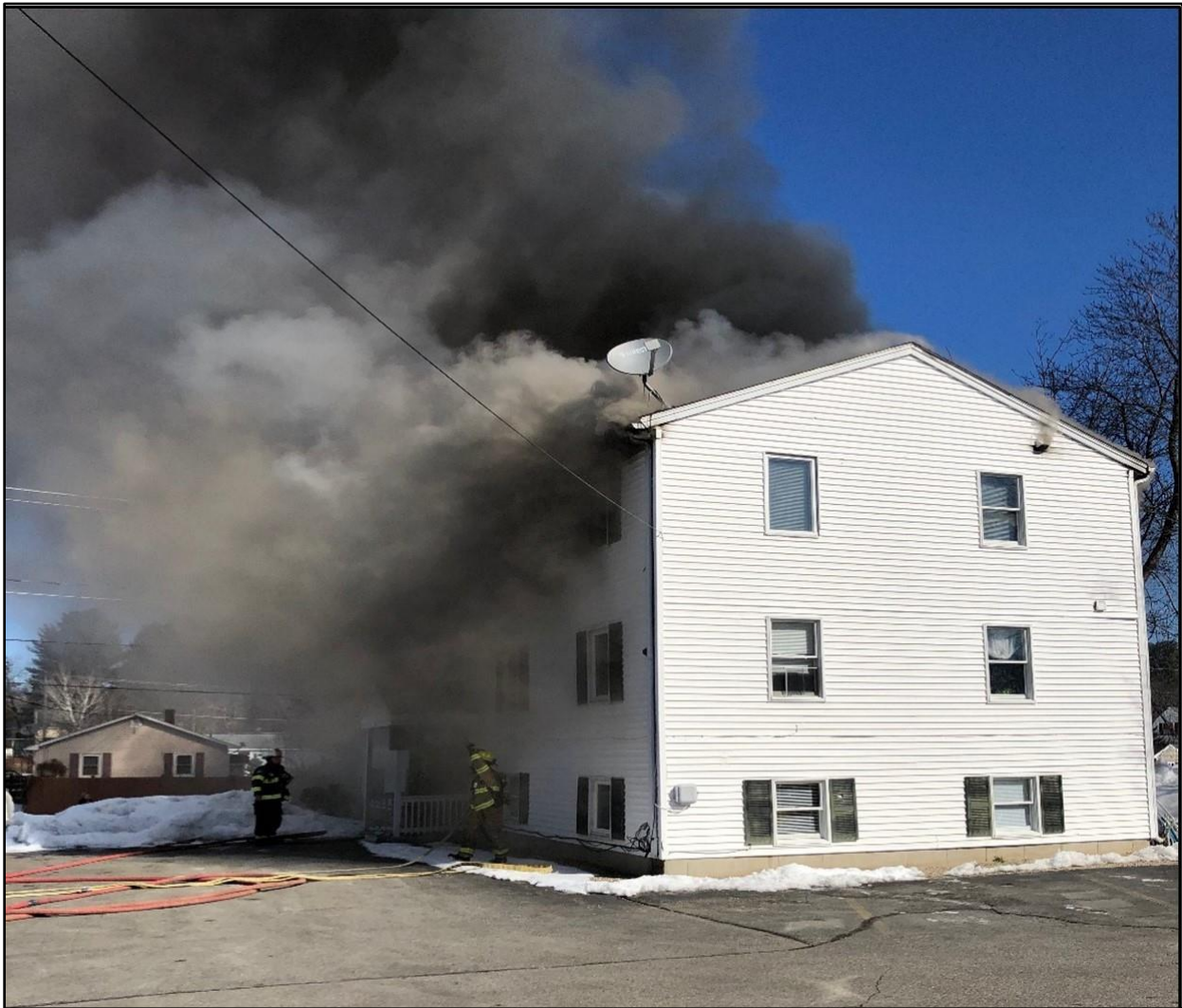
Photo 1: Initial arrival conditions. Showing Side Alpha and Side Delta. The victim was at window on 3 rd floor on Side Bravo. The time was approximately 1108 hours.

perform a primary search for a reported trapped civilian ( See Photo 1 ). The captain of Engine 2 told the other firefighter (FF2) to get a ground ladder to the 3 rd floor to rescue the trapped civilian occupant, who was hanging out the window. Meanwhile, the driver of Engine 2 was in the process of connecting Engine 2 to a hydrant. The captain and FF1 entered the stairwell through the front door with a 1¾-inch hoseline on Side Alpha at 1109 hours. FF2 and a town police officer (PD 113) placed the ground ladder to the 3 rd floor bathroom window on Side Bravo where the trapped