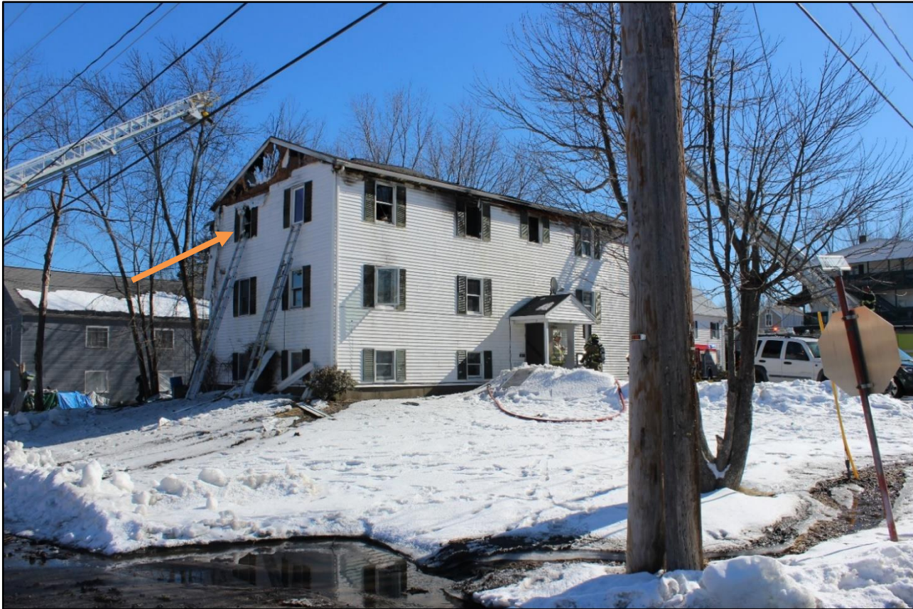
Photo 2: The orange arrow identifies the window where the civilian was located upon arrival of the fire department. The civilian was removed from the 3 rd floor window via the ground ladder.