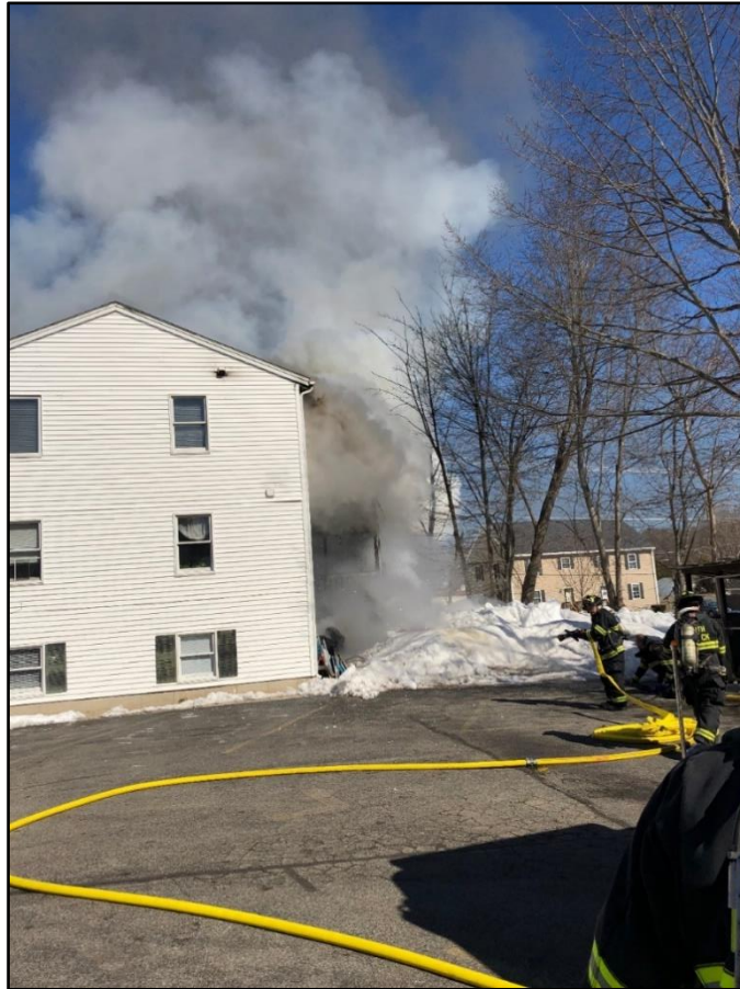
Photo 3. Exterior fire attack on Side Charlie while Engine 2 was on the 3 rd floor. The time is approximately 1114 hours.

FF1 stated the room began to cool and visibility started to improve. He recognized an area of the room that was starting to show daylight through a wall. FF1 attempted to move the captain out of the apartment but got no response. The captain was unconscious. FF1 did not have the strength to move the captain and moved to the wall to get help. He went out on the porch and frantically waved his hands. Due to the water from a portable monitor in operation, FF1 was not visible from the ground. FF1 re-entered the building and attempted to move the captain. FF1 had tucked his portable radio into his turnout coat. Unable to move the captain, FF1 went out on the porch and called Command on his portable radio. FF1 advised Command of his location and that the captain was unconscious. The time was approximately 1116 hours.