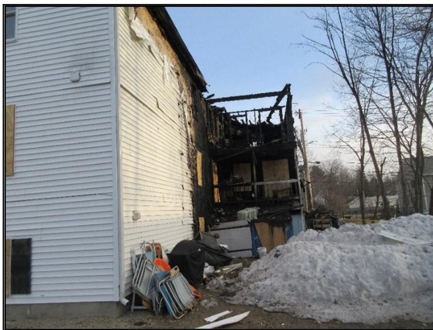
The Side Charlie 3 rd floor porch where the captain and firefighter 1 were removed.