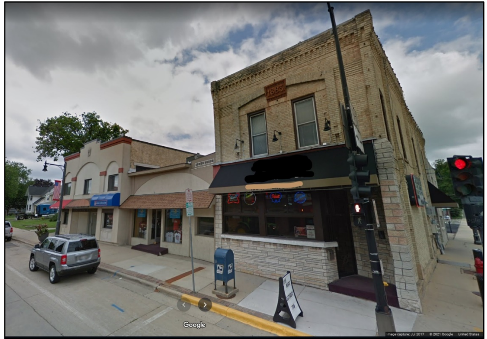
Photo 1. Side Alpha of Pub prior to explosion.