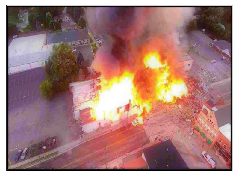
Site of Natural Gas Explosion

On July 10, 2018, a 34-year old paid-oncall/volunteer fire Captain died, and another firefighter was injured in a building explosion while responding to a report of a natural gas leak. At 1820 hours the local combination fire department was dispatched for a report of gas odor at an intersection approximately 1 block away from the fire station. The initial arriving crew immediately began evacuating the surrounding buildings. Meeting resistance from civilians who were unwilling to evacuate businesses in the area, the Incident Commander called for additional personnel to respond to the station. A Captain with the fire department arrived following the staffing request, along with several other firefighters. After checking in with the Incident Commander, the Captain, along with firefighters from the initial responding