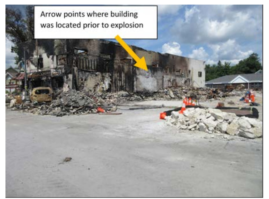
Photo 2. Site of explosion. Note the building/origin of the explosion was destroyed during the blast (NIOSH Photo)