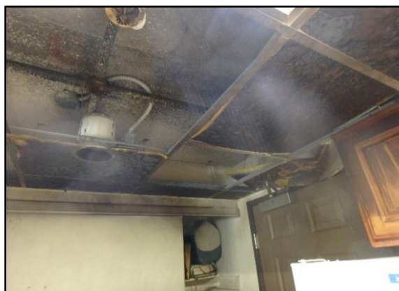
Photo 3. Sprinkler in ceiling that was activated in the apartment where the origin of the explosion occurred.

The Truck 1 captain had set up accountability and assigned stairwell side B for fire operations and stairwell side D for civilian evacuation (see Diagram 1). The Engine 10 crew went to stairwell side D, so the Truck 1 captain repeated over the radio the stairwell assignment. At approximately 0359 hours, the Engine 10 crew was met by Engine 2, who came up the side B stairwell. The Engine 2 captain asked the Engine 10 captain and crew to do a joint primary search while on air. The Engine 2 captain remained in the hallway and reported to Command that they had a sprinkler activation in the apartment and were conducting a primary search. The IC assigned the Engine 3 crew to the third floor to check the hallway and apartment above apartment 210. The Engine 2 captain noticed a woman in her apartment across the hall from 210. He informed her of the situation and requested that she shelter in place. In the hallway outside apartment 210, the maintenance worker told the Engine 2 captain that they needed to shut down the sprinkler system and that he had the key to turn it off. Engine 2 captain told him to give the key to the Engine 10 crew.