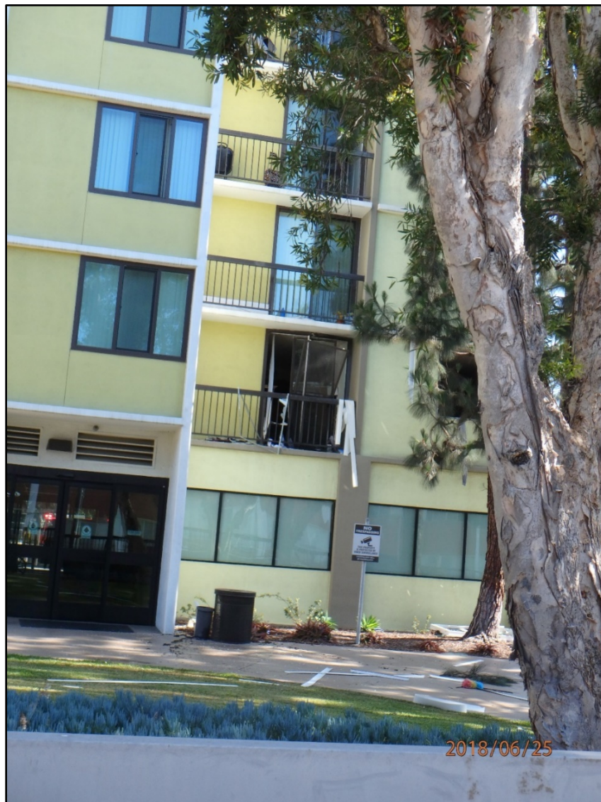
Photo 2. Side C showing windows and sliding glass doors blown out and on the ground.

scene driving by sides C and D then parking on side A. The Engine 2 captain reported no smoke or fire showing then made entry into the lobby on side A through the security gate being held open. As he entered, the captain noticed water on the lobby floor, and when he exited the lobby onto side C, he noticed shattered glass and window fragments on the ground (see Photo 2). Looking up, the captain saw and reported windows and sliding glass doors “blown out” from the second floor, side C. The captain and crew were then led to side D by the maintenance worker to the fire control room.