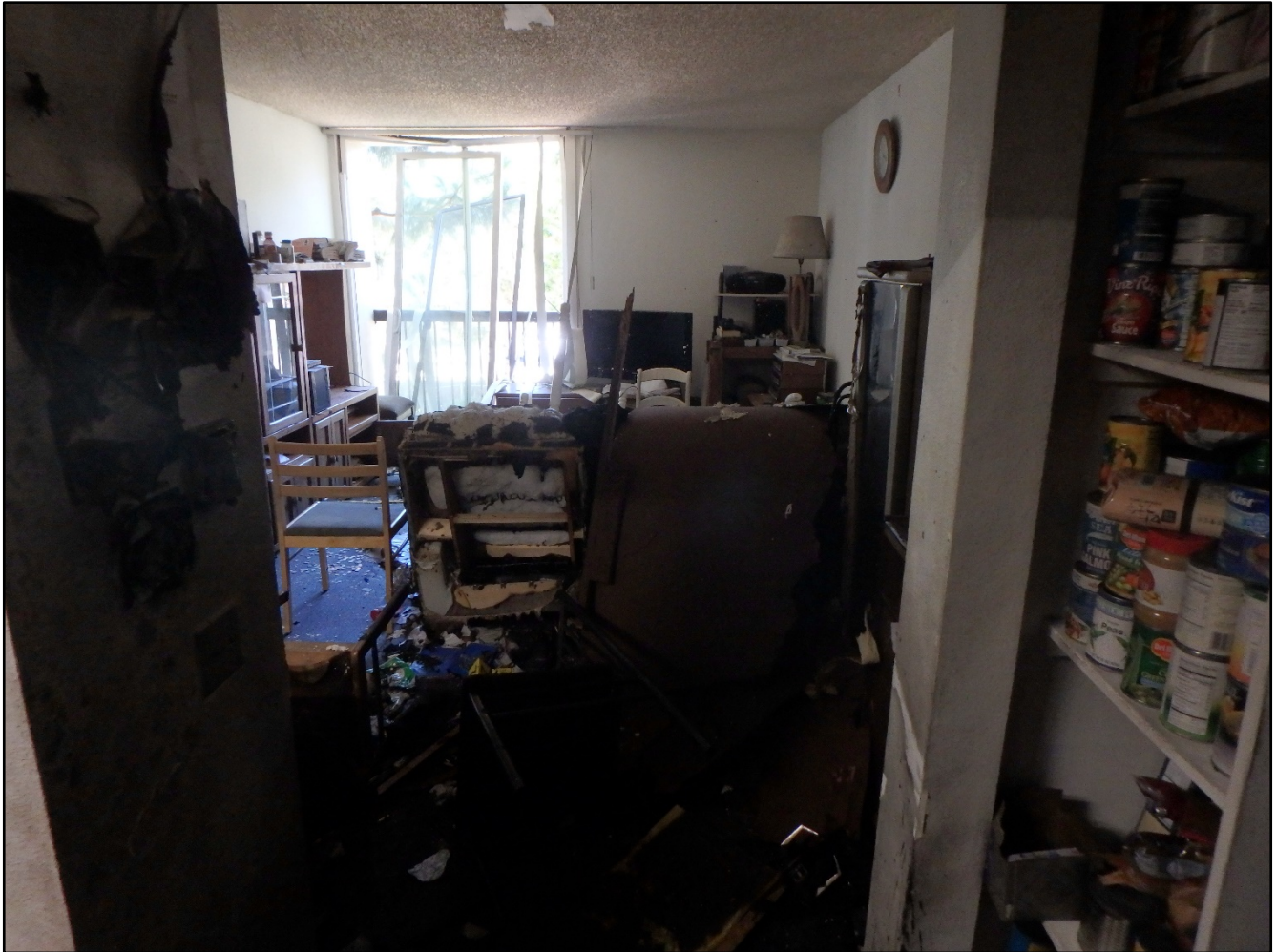
Photo 5. Shows blown out and bent door wall frame and burned chair covering from explosion.