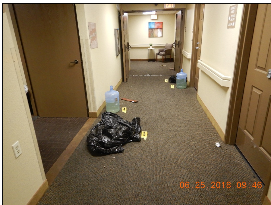
Photo 8. Shows containers of gasoline set in hallway producing the smell the fire fighters detected.

In this incident, fire fighters were carrying out assigned duties and weren't expecting anything to happen out of the ordinary despite the smell of gasoline and evidence of an explosion were present. Numerous fire fighters heard the gunshots but mistook them for explosions. After the scene was cleared it was discovered that the arsonist/shooter had placed 5 gallon water jugs of gasoline (half full) in the second floor hallway that were covered with black garage bags to later set off (see Photo 8 ).