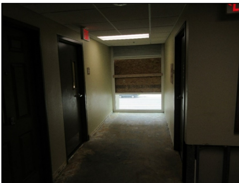
Photo 4. Blown out second floor window on side D hallway that the captain leaned out to yell to paramedics about the injured resident in a chair by the window.

The Engine 10 captain went to investigate the second floor when he encountered a resident with burns on his hands sitting in a chair at the end of the second floor side D hallway. The side D hallway window had been blown out from the pressure of the explosion, so the Engine 10 captain leaned out the opening and yelled down to a Rescue 1 paramedic that he had a patient on the second floor (see Photo 4 and Diagram 2). The Rescue paramedic knodded okay as he headed for the side D stairwell. The captain was near the D stairwell when the resident pulled out a revolver and shot the captain in the torso. The rescue paramedic heard the “pop,” but thought it was another explosion. He then heard the captain lunging into the stairwell yelling that he had been shot by an active shooter.