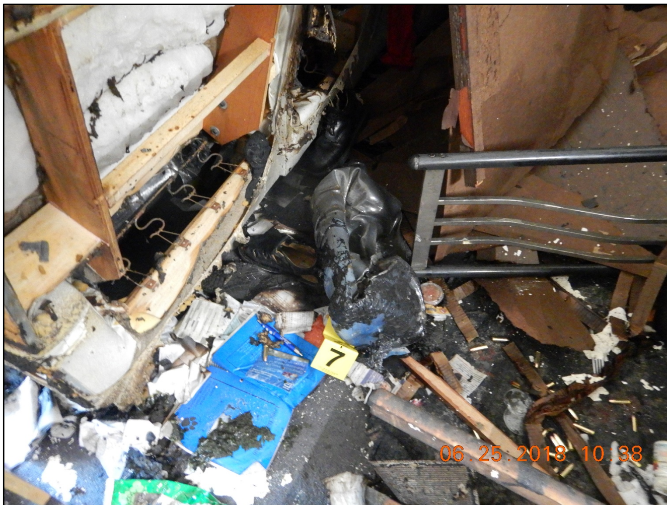
Photo 7. Remains of plastic water jug that contained gasoline to set off explosion in the apartment behind the chair.