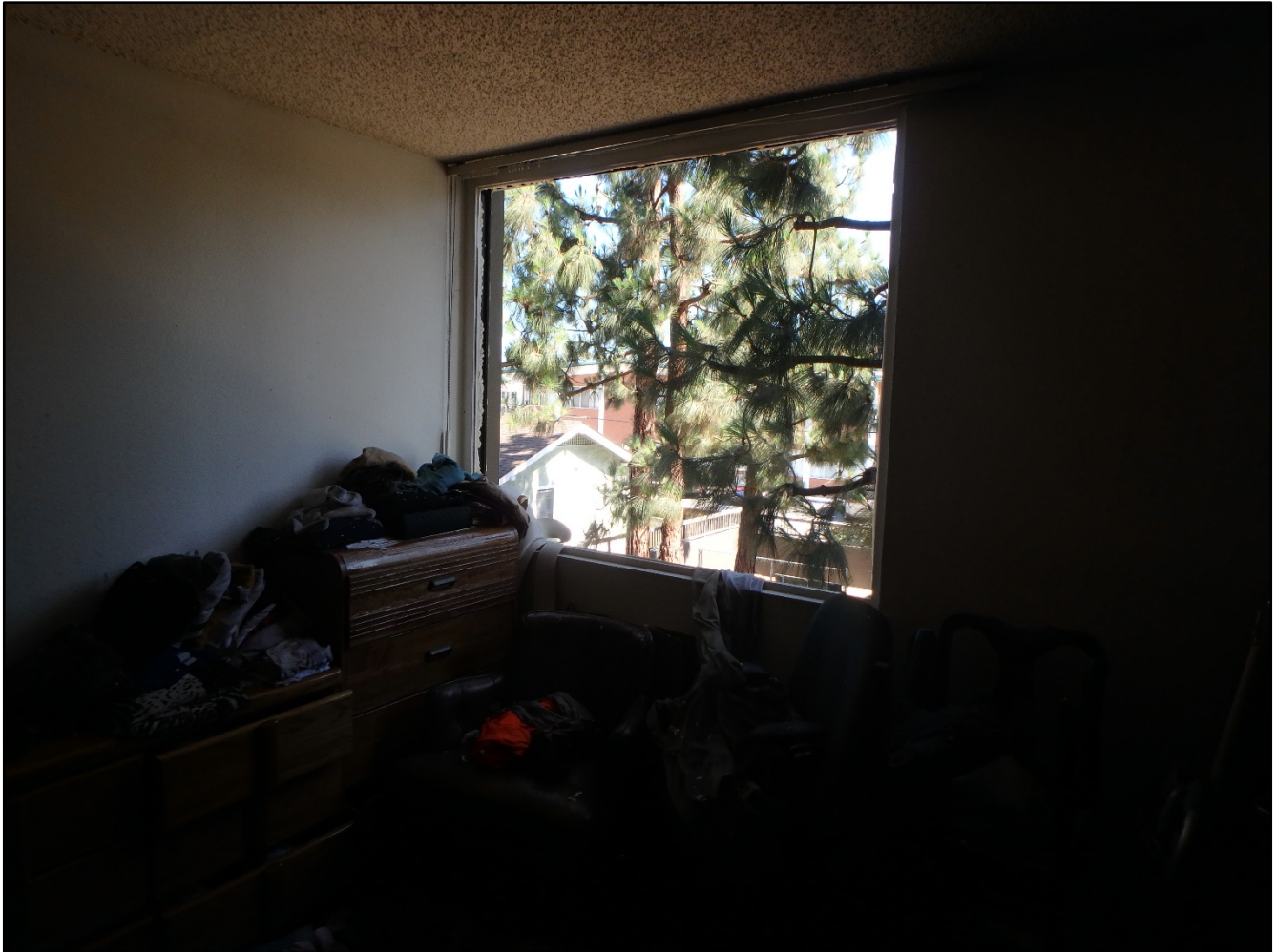
Photo 6. Blown out second floor window in the apartment of explosion's origin.