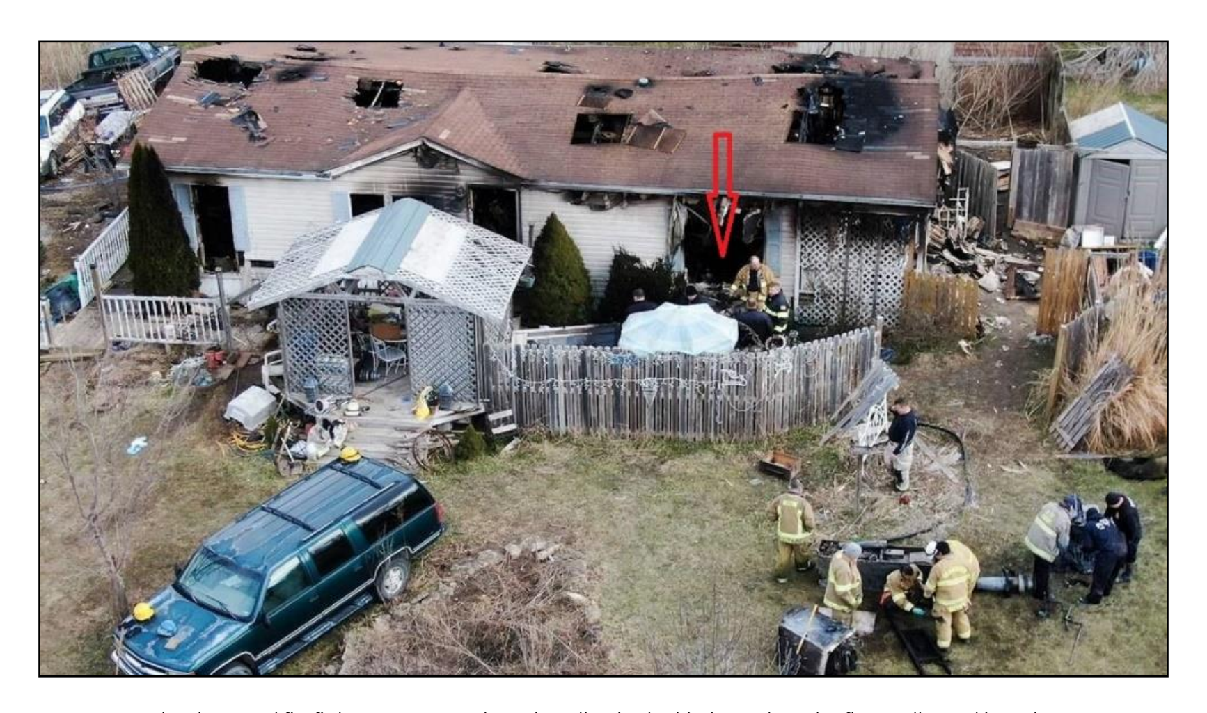
The deceased firefighter was operating a hoseline in the kitchen when the floor collapsed into the basement. The red arrow indicates the kitchen area.