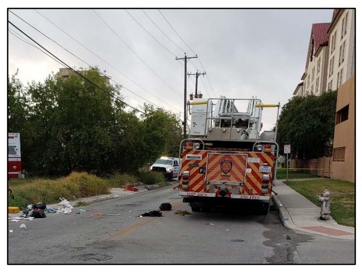
Aerial Platform 1 parked in the southbound lane of a two-way street. The firefighter-paramedic was struck in the northbound lane.

On October 15, 2019, at approximately 0711 hours, a 49-year-old career male firefighter-paramedic was struck and killed by a delivery van. The firefighter's company, Aerial Platform 1, was dispatched at 0704 hours to assist Engine 1 with ventilation for light grey smoke and a burnt plastic odor in a hotel lobby. Aerial Platform 1 arrived on scene and parked in the southbound lane of a two-lane commercial street. All four crew members of Aerial Platform 1 gathered at the rear of the truck to unpack the electrical ventilation fans. None of them were wearing reflective vests over their station uniforms. As the crew of Aerial Platform 1 began to make their way toward the hotel, the captain asked the firefighter-paramedic to retrieve the thermal imaging camera (TIC) from the apparatus. At approximately 0711 hours, the firefighter-paramedic was near the