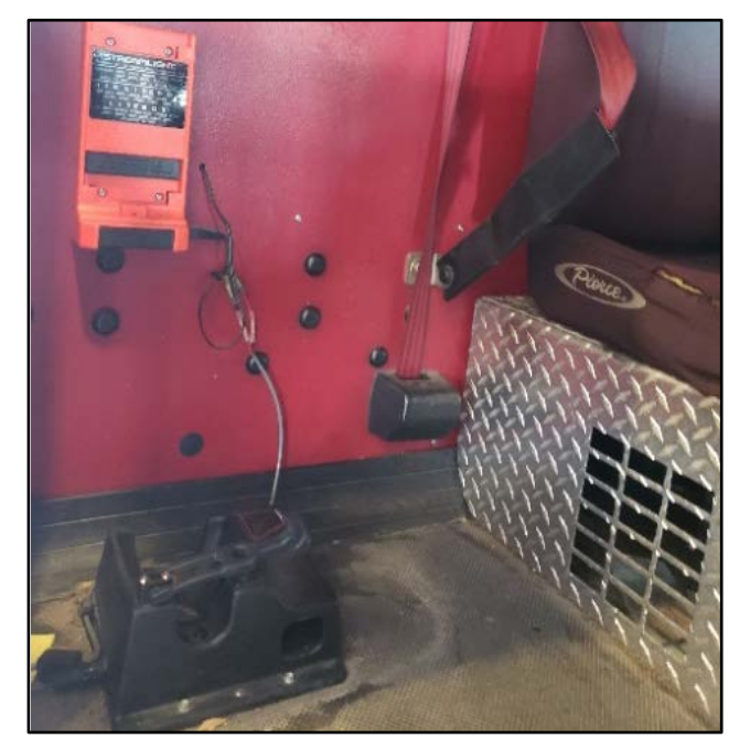
Photo 3. Aerial Platform 1 replacement apparatus. TIC charger bolted on the floor behind the officer's seat.