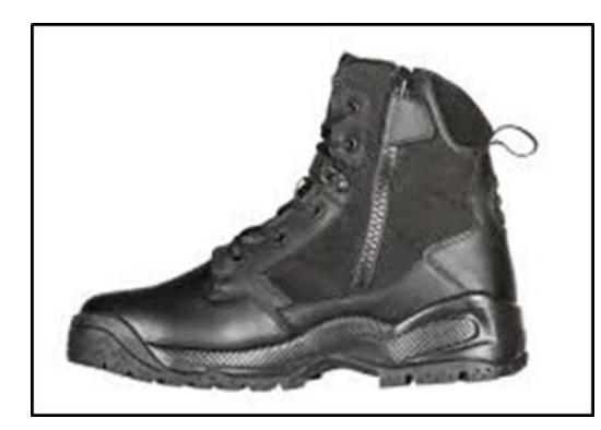
Photo 4. Similar tactical zippered station boot worn by the firefighter-paramedic.

Some firefighters leave the side zipper open to facilitate boot removal when responding to a fire emergency requiring the use of bunker boots. According to his crew members, the firefighter-paramedic frequently kept his boots in the unzipped position. During this incident, the firefighter-paramedic's turnout pants, coat, and bunker boots were in the rear cab of the apparatus covering the TIC charging in its docking station located on the floor of the rear seat behind the officer (see Photo 5).