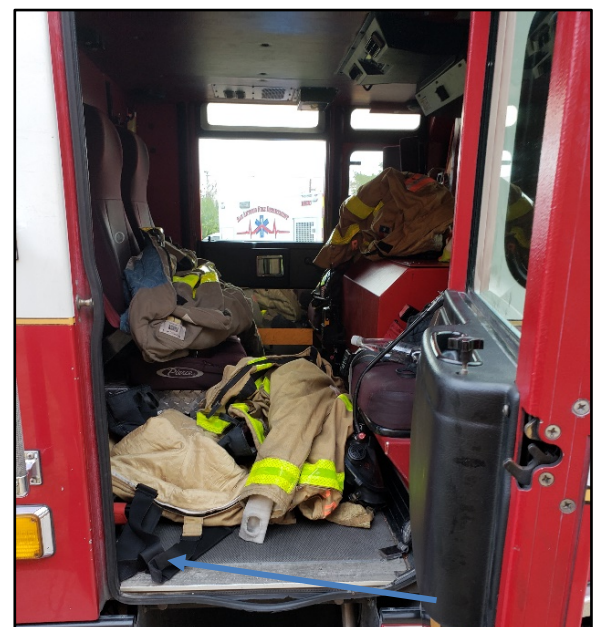
Photo 5. Replacement Aerial Platform 1 rear cab compartment at the incident. Note the firefighter-paramedic turnout gear covering the TIC and its charger.

The incident occurred on a two-lane road traveling north and south divided by a double yellow line. The asphalt roadway surface was dry when the incident occurred. The roadway had no shoulder. There was a