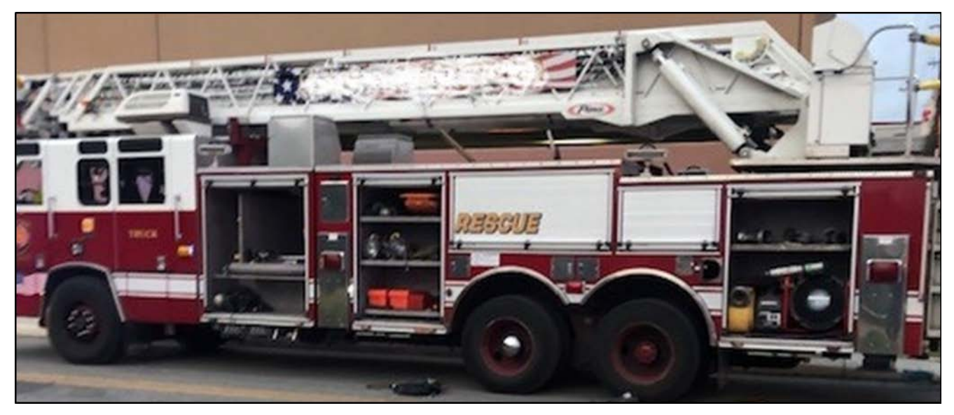
Photo 1. Replacement aerial platform.

On October 13, 2019, two days before their shift, Station 1's Aerial Platform (2013 Pierce Quantum – Aerial Platform) was recalled for maintenance. The replacement apparatus (see Photo 1) was a 2005 Pierce Quantum Aerial Platform built to conform to the requirements of the 2003 edition of NPFA 1901, Standard on Automotive Fire Apparatus [NFPA 2003].