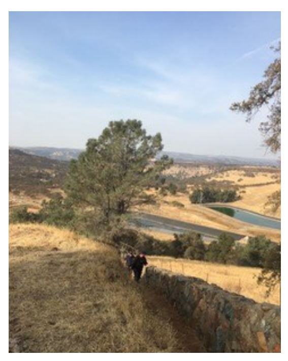
Photo 2. Firefighters hiking up a portion of the trail.

The trainee made the first of two trips up the hill at approximately 0711 without issue. Upon completion of the first trip at approximately 0720, the trainee was asked by the fire captain how he was doing, and the trainee replied, "I'm good." At approximately 0734, as the trainee neared the top of the climb for a second and final trip, he took a knee and said he needed to catch his breath. The crew members told the trainee he was only 25 feet from the top and it would be better to stand because it would be difficult to get back up. The trainee decided to take a knee anyway and as he took a knee, the crew assisted him taking his pack off to help him cool down. After a five-minute rest, the crew helped the trainee back to his feet, put his gear back on and he completed the climb to the top at 0750.