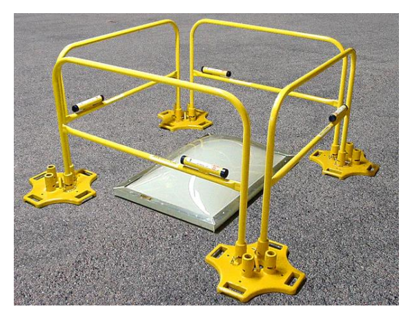
Photo 6. <u>Blue Water-Roof Hatch & Skylight Fall</u> <u>Protection Safety Rails</u>, Colorado Safety Supply Company [2023]

Examples of protective systems for skylight railings and covers are shown below in photos 6 and 7, respectively.