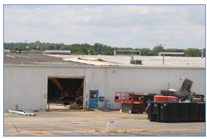
Photo 3. Building undergoing demolition on day of fatal incident

On the day of the fatal incident, four employees began work at approximately 9:00 a.m. These employees were tasked with removing sections of the garage roof. At the time of the incident, a portion of the roof had already been removed, as shown in Photo 3. Progression of the demolition work is shown in Photo 4.