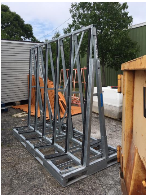
Figure 3 - A-frame rack involved in the incident without the caster wheels attached and the safety posts not installed.

An A-frame rack was in use at the time of the incident and was designed to hold slabs in a range of sizes (Figure 3). The rack was equipped with removable caster wheels that were in place at the time of the incident. The caster wheels consisted of 8-inch diameter roller bearing wheels that were rated at 2,000 pounds each. Two of the four wheels were swivel casters with brakes and the other two wheels were rigid. The rack's rated capacity was 8,000 pounds, 4,000 pounds for each side of the rack with the installed wheels (it had a 10,000 pound capacity, 5,000 pounds per side, without the optional wheels installed). The rack was equipped with four hold-down ratchet straps to secure the slabs being stored on the rack. It was also equipped with four safety posts, two for each side, to prevent a slab from tipping off the rack and provide safe access of unstrapped loads that may shift unexpectedly. The rack was 96 inches long by 28 inches wide and 99 inches high (88 inches high without the optional caster wheels).