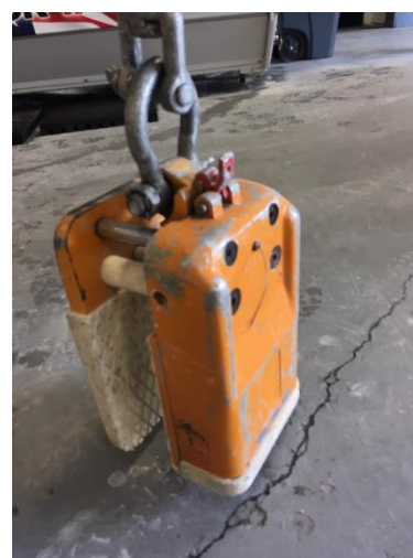
Figure 2 – The slab lifter.