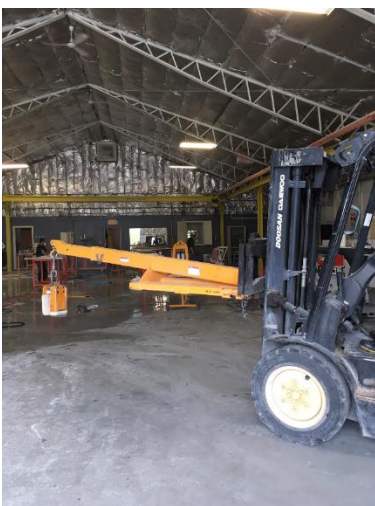
Figure 1 – The forklift inside the shop with the boom and slab lifter attached.

The telescoping boom attachment consisted of two rectangular steel tube sections. Specifications from the manufacturer indicated the boom weighed 286 pounds, had a maximum rated load capacity of 3,300 pounds when fully retracted, and a maximum load capacity of 1,320 pounds when fully extended. The telescoping range of the boom was from approximately 6.8 feet to 11.7 feet in three increments of 19 inches. The boom could only be extended manually and had a series of pins and clips to hold it in position. The boom attached to the forklift by sliding onto the forklift tines and was secured by two bolts and two restraint pins (Figure 1).