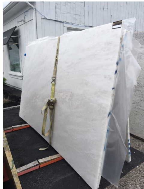
Figure 4 – The marble slab involved in the incident.