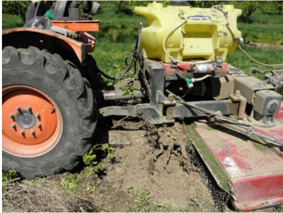
Photo 1: Position of tractor and mower after pushing over and becoming stuck on a pear tree