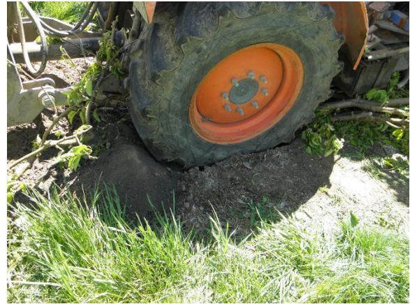
Photo 2: Right rear tire that continued turning after tractor ran over and became stuck on tree

rear tire still turning (Photos 1 and 2). While the other employee stayed with the victim, the tractor manager went to the tractor and shut it off by pulling the engine stop and removing the key, and then called 911. Emergency responders arrived and began CPR, but the victim was declared dead at the scene.