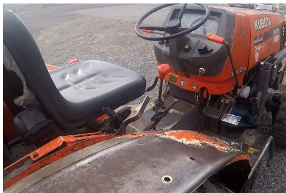
Photo 5: Gear selector placement in center of operator’s compartment.

Another possibility is that he left the shuttle in the “forward” position and put the gear selector in the center of the operator’s compartment (Photo 5) in the neutral position, then contacted the lever with his leg as he attempted to dismount, shifting the tractor into gear causing it to move forward.