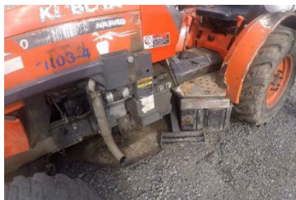
Photo 7: Left side of tractor showing step designed for mounting and dismounting

In addition, the foot throttle pedal blocked the way for easy access or egress from this side of the tractor (Photos 6 and 7). It would not have been possible to safely dismount the tractor