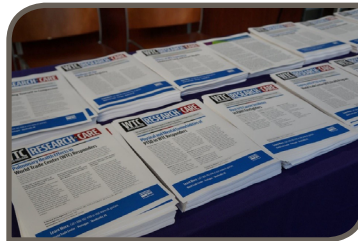
Research in 9/11 Health Exposures and Treatment