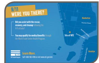
Outreach and Education