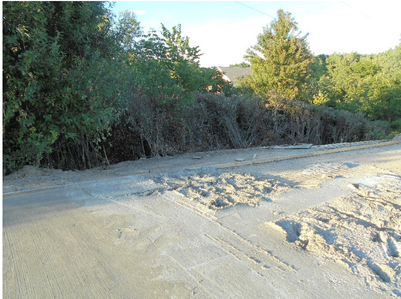
Figure 3: Vegetation along north end of worksite

The decedent was reported to not be wearing any personal protective equipment (PPE) at the time of the incident, although the police report noted that he had been wearing work boots and