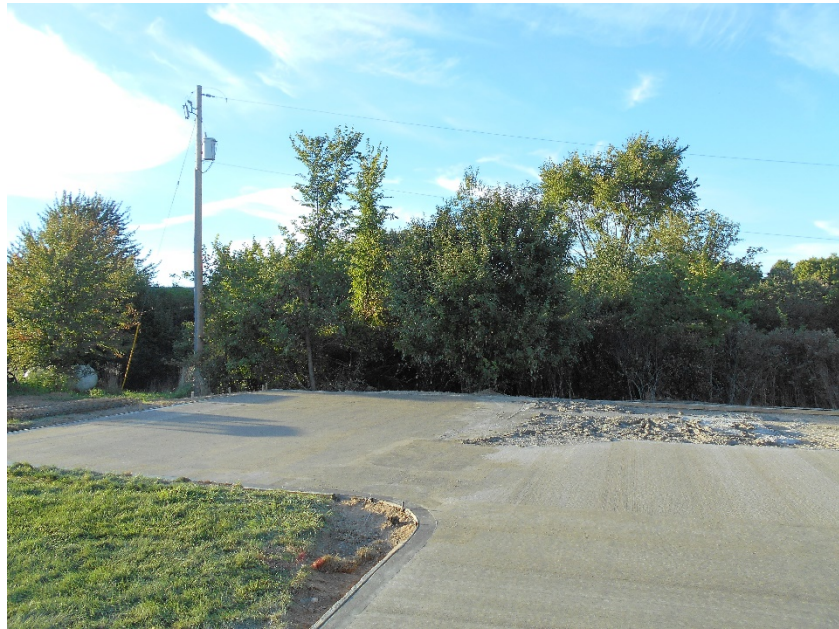
Figure 1: Overview of incident scene

incident occurred. A line of brush was approximately 8 feet away from him under the power lines, which may have required him to elevate the bull float handle rather than pull it in a more horizontal position. The decedent was wearing non-electrical rated rubber boots over his leather work boots, vinyl work gloves, hard hat and safety glasses. When the bull float handle contacted the overhead line, the decedent fell forward, letting go of the