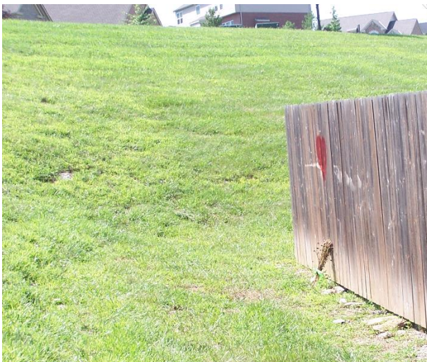
Figure 4. Flowers and a heart representing where the victim and overturned lawn mower were discovered.

approximately 10 feet down the slope with the mower in this location, and the other lawn maintenance workers would return later to cut the rest of the embankment with string trimmers. The victim was to use a 2004 Scag brand Turf Tiger zero-turn mower to mow the area.