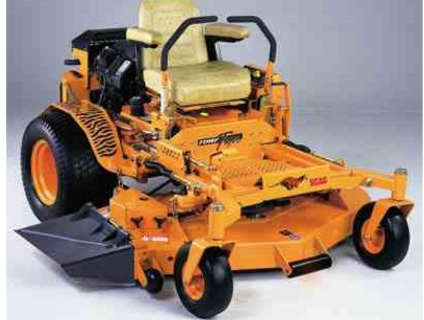
Figure 3. Stock photo of a Scag brand Turf Tiger zero-turn riding lawn mower without ROPS installed.

According to a representative for the employer, the user manual stated that the rollover bar was optional. The owner's manual clearly stated that while the rollover bar was optional, it should be used if the mower was to be operated on slopes or inclines to ensure operator safety. 1