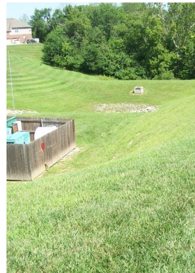
Figure 1. Area where mower overturned at jobsite.