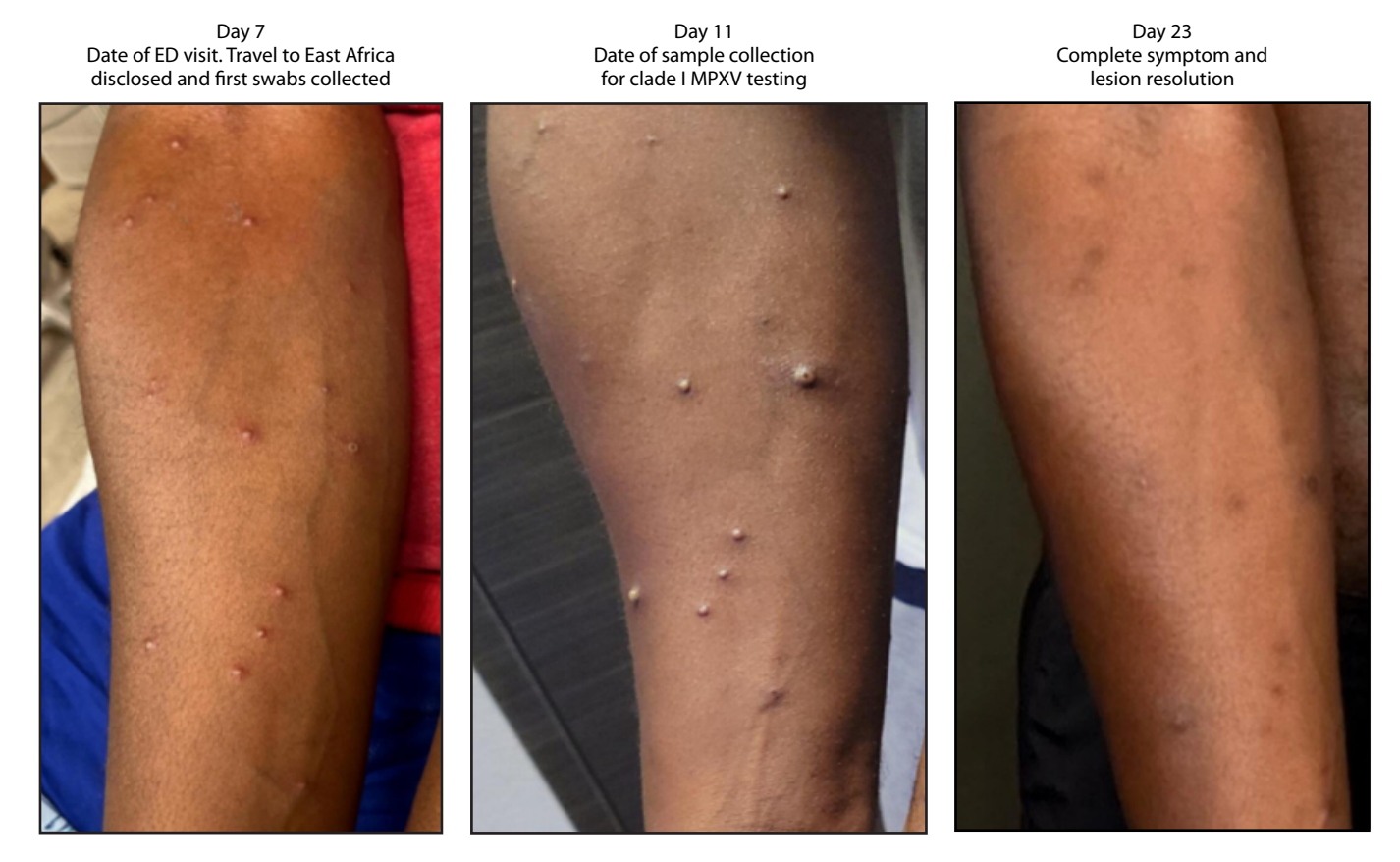
Photos/Anna Branzuela (photos reproduced with the patient's permission) Abbreviations: ED = emergency department; MPXV = monkeypox virus.

FIGURE 2. Progression of lesions in a patient with clade lb monkeypox virus infection 7, 11, and 23 days after return to the United States from East Africa — California, 2024