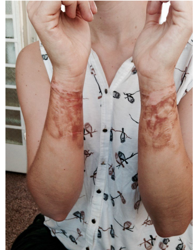
Chlorine burn from dunking hands with gloves on in bucket –unknown concentration in bucket (Sierra Leone 2014 Ebola Virus Disease outbreak)