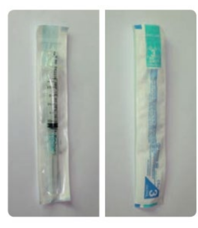
New and undamaged packaging