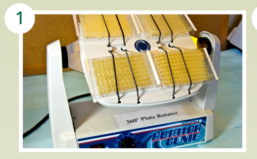
After 42 hours of incubation, remove plates from the incubator and place them into a 360 degree orbital mixer for 30 min. During this time the plates cool down to room temperature and mix thoroughly.