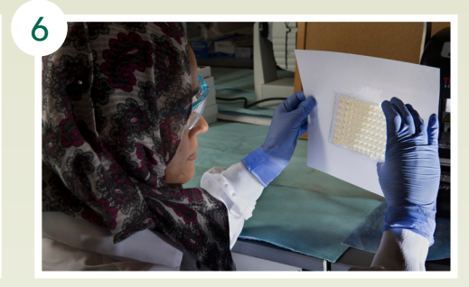
Review the calibrator plate and the sample plates for contamination, leaking, dark color, or abnormal volume. If confirmed as random occurrences, mask the wells.