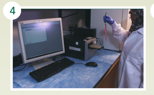
During this minute, wipe the plate bottom to remove any particles or dust, open the sealing membrane carefully to prevent liquid spilling, and place the plate into the plate reader. Gently fan the air above the plate to remove micro-bubbles.