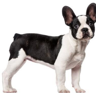
Photo: Example of an acceptable photo showing the face and body of a dog

Attach a photo of the dog showing its face and body (see example below). Only .jpg, .jpeg, or .png files are accepted. Maximum file size is 1mb. If your file is larger than 1mb or in a different format, you must save the file as one of the acceptable file types and reduce the file size. Dogs less than one year old should have this photo taken within 15 days before they will arrive in the United States.