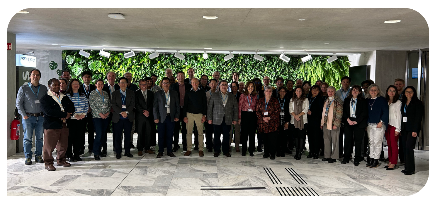
Participants attending the first global CoViNet meeting, Geneva, Switzerland.