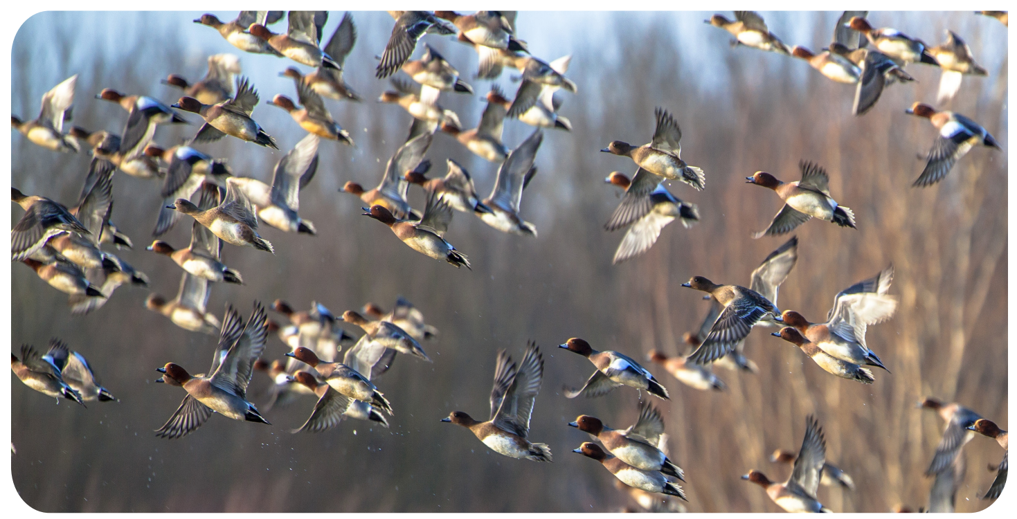
Eurasian wigeons migrating through Central Asia.

Academic partners brought knowledge, contacts, relationships, and research that combined seamlessly with CDC's technical expertise, training, and local staff to make a significant impact on bird flu surveillance in Georgia. Using a One Health approach, these capacities help address a gap in global bird flu surveillance, protecting the world from emerging animal-to-human diseases.