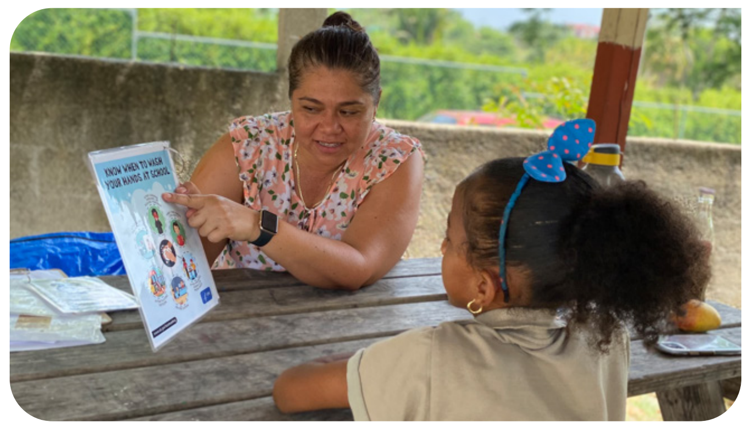
A nurse in Belize teaches key times to wash hands.

In countries with limited resources and competing health threats, local collaborations can provide trusted, credible information to communities that need it most. They also produce a community of advocates who keep fighting for vital health services long after the campaigns end.