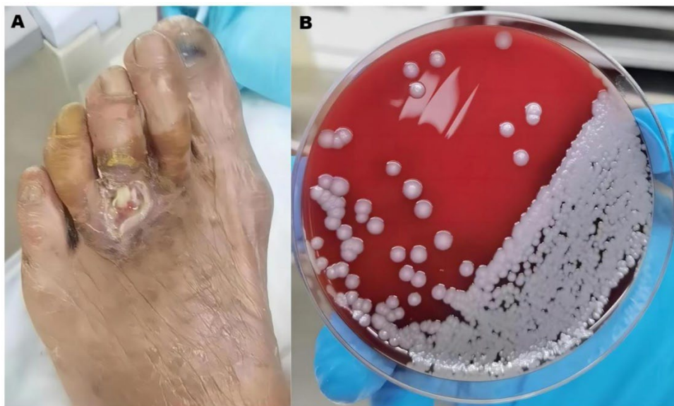
Appendix Figure 1. Morphologic features of left-foot diabetic foot infection caused by B. thailandensis 2022DZh in a patient in Dazhu, Sichuan, China. A) Result of surgical debridement