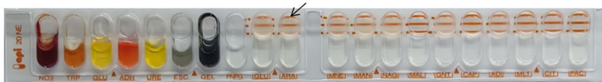
Appendix Figure 2. The biochemical profiles of the API 20NE system, including arabinose assimilation, identified isolate 2022DZh as B. thailandensis .

of a wound in the 61-year-old male patient. B) Colony morphology of B. thailandensis 2022DZh from the patient on a Columbia blood plate.