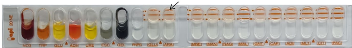
Appendix Figure 2. The biochemical profiles of the API 20NE system, including arabinose assimilation, identified isolate 2022DZh as B. thailandensis .

of a wound in the 61-year-old male patient. B) Colony morphology of B. thailandensis 2022DZh from the patient on a Columbia blood plate.