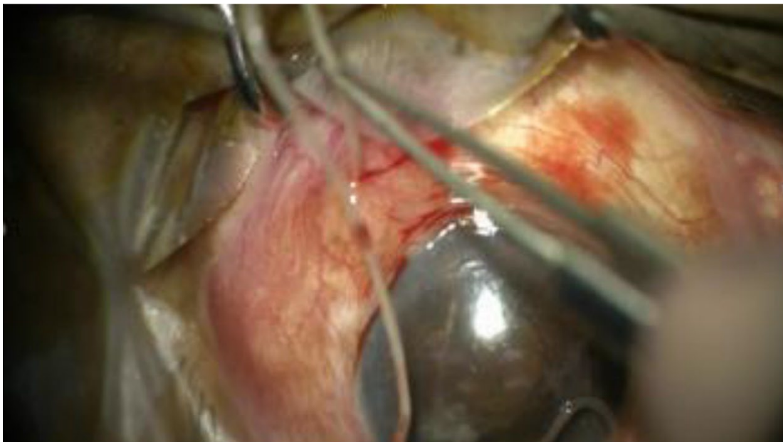
Appendix Figure. Surgical removal of subconjunctival infection by Dirofilaria sp. 'Hong Kong genotype' from a patient in Australia who recently migrated from Sri Lanka.