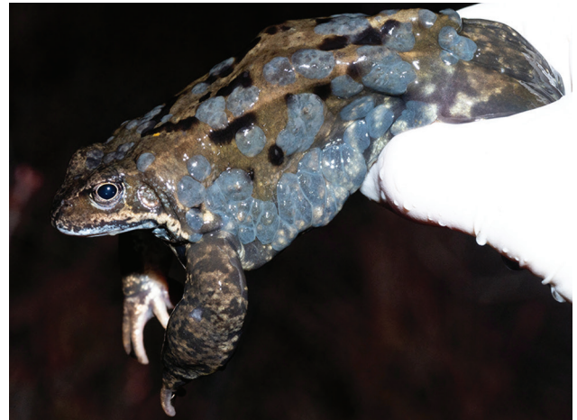
Figure 1. Ranid herpesvirus 3 infection in common frog Rana temporaria tadpoles, Norway. Image shows a large number of multifocal to coalescent, mildly elevated, gray patches (epidermal hyperplasia) extending over most of the integument, particularly clustering along the left flank. Between gray areas is normally pigmented skin.

Finding genomic RaHV3 DNA in free-ranging tadpoles is a major step toward understanding the