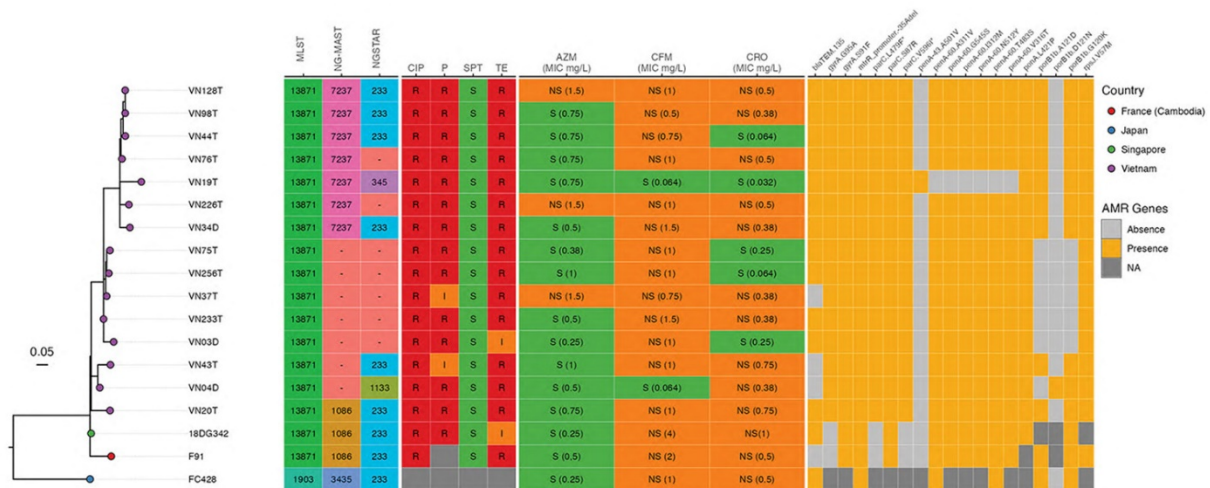
phylogenetic tree of Neisseria gonorrhoeae ST13871 samples including 15 isolates from Vietnam during 2019 – 2020, 1 from Singapore (18DG342), and 1 from France (F91), the FC428 strain was used as an outgroup. Sequence types from the MLST, NG-MAST, NGSTAR database; phenotypes and AMR determinants are displayed. Sequence types that have not yet been assigned with a number are indicated as a dash. The phenotypes include Resistance (R), Susceptible (S), Intermediate (I) and Non-susceptible (NS). AMR determinants are antimicrobial resistance gene and their amino acid changes; asterisk symbol (*) refers to a novel mutation. NA (not available) represents phenotypes or resistance genes that were not reported. CIP: ciprofloxacin, P: penicillin, SPT: spectinomycin, TE: tetracycline, AZM: azithromycin, CFM: cefixime, CRO: ceftriaxone.