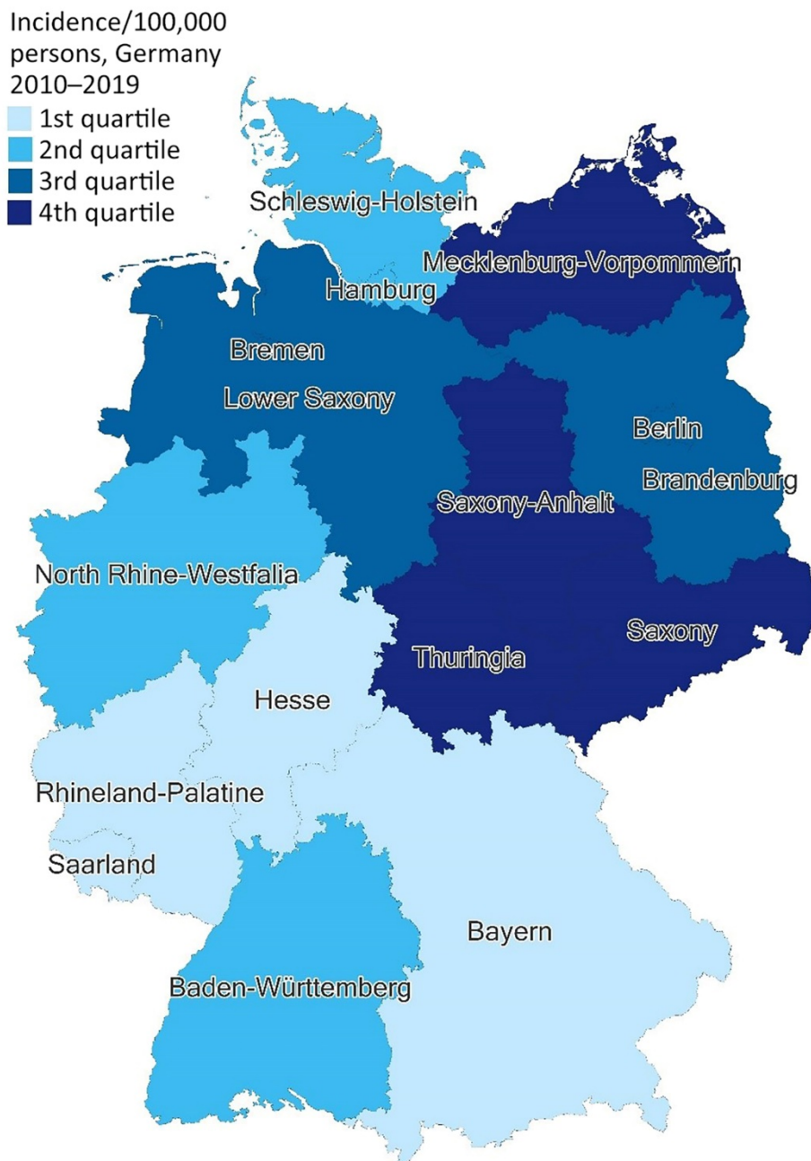
Appendix Figure. Spatial distribution of average annual incidence of pregnancy-associated and non-pregnancy associated listeriosis in federal states, Germany, 2010–2019 (n = 5,575)