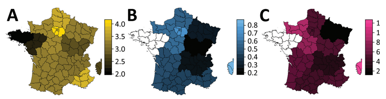
Figure 2. Regions of France in study of rapid spread of SARS-CoV-2 variants, January 26–February 16, 2021. For each region, we show the log<sub>10</sub> of the number of tests analyzed (A), the estimated total variant frequency by February 16, 2021 (B), and the estimated percentage transmission advantage (of the variant strains relative to the wild-type strain (C). Additional details in Appendix 2 Figure 5 (https://wwwnc.cdc.gov/EID/article/27/5/21-0397-App2.pdf).

from RT-PCR amplification cycles could provide useful insights. Finally, earlier reports have found variant proportion to be associated with higher basic reproduction number (4; E. Volz et al., unpub. data). We found such a trend among regions in France, but it is not statistically significant.