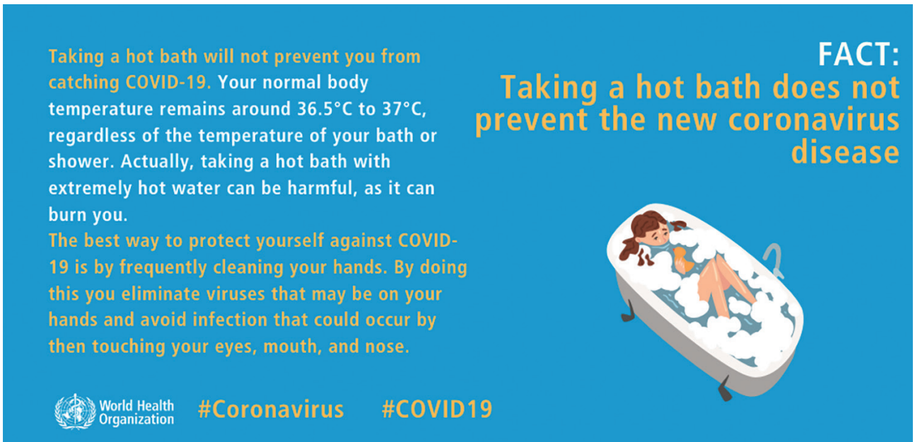
Figure. Original World Health Organization myth buster graphic used in study of addressing COVID-19 misinformation on social media. COVID-19, coronavirus disease.

temperature (11,12). Temperatures needed to deactivate coronavirus are typically >56^{\circ}\text{C} (13–15), which exceed safe bath temperatures; scalding is likely within 10 minutes at 48^{\circ}\text{C} (16). In other words, this graphic explains the science for why hot baths do not prevent COVID-19 and directly disputes the prevention efficacy of baths. The graphic follows many best practices for combating misinformation: it is fact-based, colorful, simple, and easy to understand; focuses on the fact rather than the myth; and includes a label signaling that it comes from an expert source (7,9,10). These aspects fulfill many of the 5 Cs of correction: is consensus based, includes corroborating evidence, and is consistent, coherent, and credible (6). Addressing the science behind why hot baths do not prevent COVID-19 infection also corroborates the argument with a science-based alternative explanation shown to boost correction effectiveness (6,7,17). Therefore, we expected that exposure to a post containing this graphic would reduce the 2 misperceptions among persons targeted by the graphic as compared with persons who did not see any information on the topic.