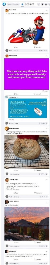
Appendix 1 Figure 1. Experimental stimuli from WHO responsive condition, showing full feed.