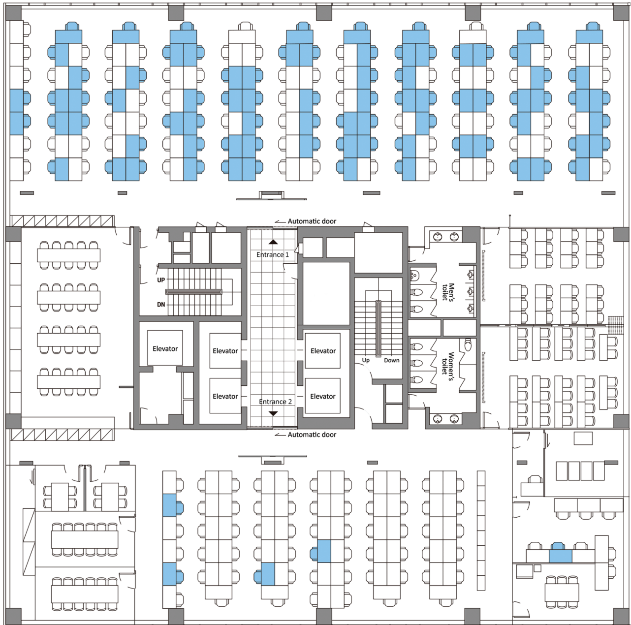
Figure 2. Floor plan of the 11th floor of building X, site of a coronavirus disease outbreak, Seoul, South Korea, 2020. Blue indicates the seating places of persons with confirmed cases.

identified 97 (8.5%, 95% CI 7.0–10.3) confirmed case-patients (Figure 1). Of 857 patients for whom demographic information was available, 620 (72.3%) were women; mean age was 38 years (range 20–80 years). Most (94 [96.9%]) of the confirmed case-patients were working on the 11th-floor call center, which had a total of 216 employees, resulting in an attack rate of 43.5% (95% CI 36.9%–50.4%) (Table 1; Figure 2). Most of the case-patients on the 11th floor were on the same side of the building. Among the 97