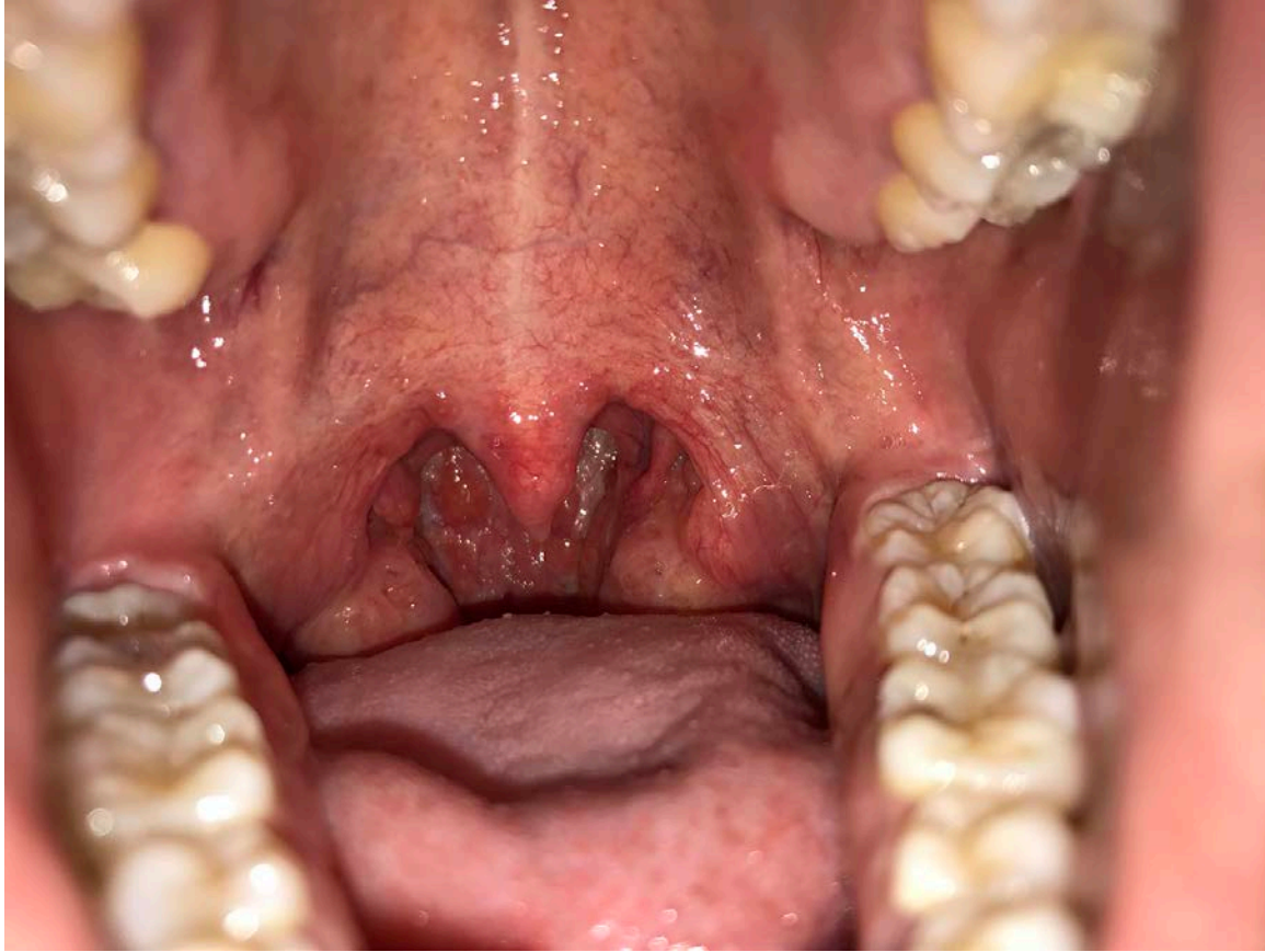
Appendix Figure 2. Throat redness of case-patient 2, a 27-year-old man with mild upper respiratory symptoms who tested positive for 2019 novel coronavirus (COVID-19).