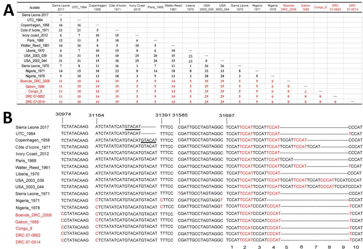
Appendix Figure. A) Nucleotide differences between Sierra Leone 2017 MPXV fragment and other MPXV isolates. Red indicates Congo Basin clade. B) Molecular signature of Sierra Leone 2017 MPXV fragments and other MPXV isolates. Numbers at top show genome positions of Sierra Leone 1970.

Phylogenetic analysis and molecular signatures of monkeypox virus (MPXV) Sierra Leone 2017 and other collected MPXV isolates.