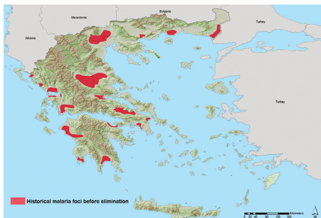
Figure 2. Areas of historic malaria transmission before elimination, Greece. Greece was officially declared malaria free in 1974, after a national malaria elimination effort during 1946–1960. Data sources: adapted from (10); Ministry of Health. Map of confirmed laboratory species–1952, unpub. data.

activities, and awareness rising among the general population and health care workers, in the areas environmentally suitable for transmission.