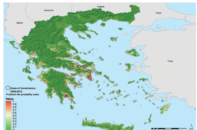
Figure 1. Areas latently hospitable and environmentally permissive for persistent malaria transmission, Greece, 2009–2012. Map showing areas predicted to be environmentally suitable for malaria transmission. Values from 0 to 0.5 (dark to light green) indicate conditions not favorable for malaria transmission (based on locally acquired cases); yellow to dark red areas delineate conditions increasingly favorable for transmission (values from 0.5 to 1).

Model accuracy and public health practice can be improved through vigilant disease and vector surveillance with timely case notification (12). Yet, despite these potential limitations, we believe that this spatial analysis is a useful tool; it can help guide response(s), integrated preparedness and response activities, including targeted epidemiologic and entomologic surveillance, vector control