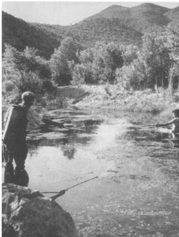
Figure 3. Larviciding.

The widespread use of DDT was not required, considering the potential negative effect on the environment