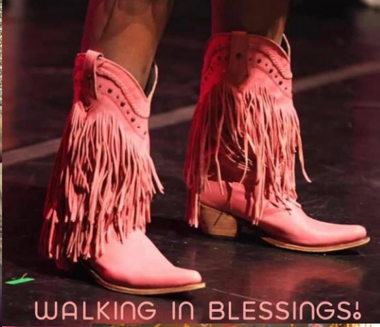
WALKING IN BLESSINGS!