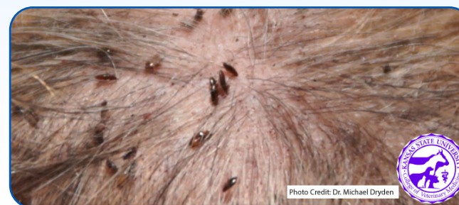
Fleas on a dog