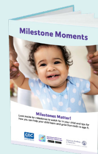
Milestone Moments Booklet Comprehensive, family-friendly; includes all milestone checklists as well as tips for supporting a child's development at every age

www.cdc.gov/ActEarly | 1-800-CDC-INFO (1-800-232-4636)