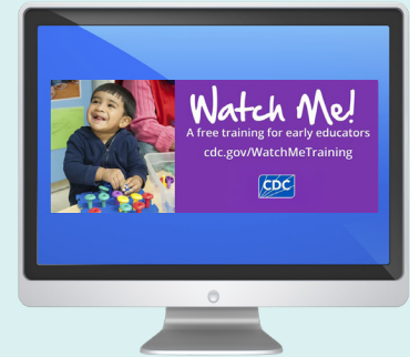
Watch Me! Training FREE 1-hour online CEU course for early educators