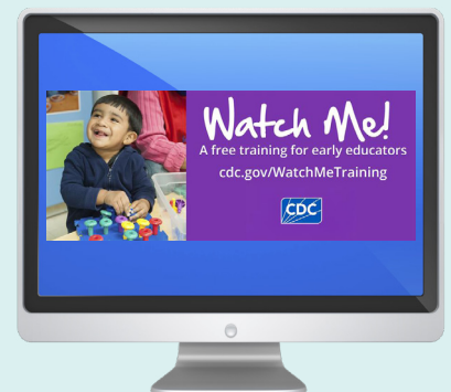
Watch Me! Training FREE 1-hour online CEU course

Encourage families and caregivers to celebrate each child's development.