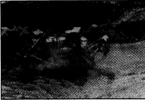
Figure 1.—Surface mine excavation with a CAT D11N bulldozer.