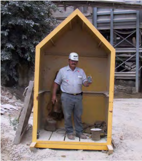
Figure 2. Blasting shelter used at a surface limestone mine in Southwestern USA