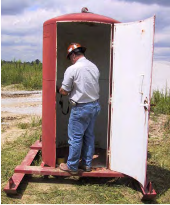
Figure 3. Blasting shelter at a surface limestone mine in Ohio