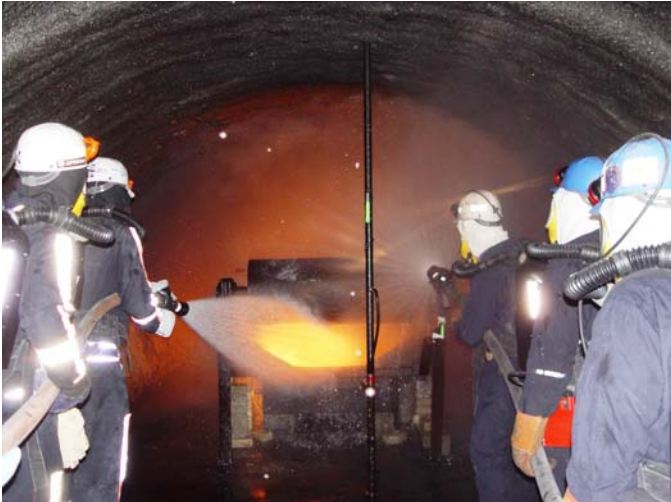
Figure 3. NIOSH LLL outdoor fire gallery simulated belt entry) showing two teams extinguishing a fire.