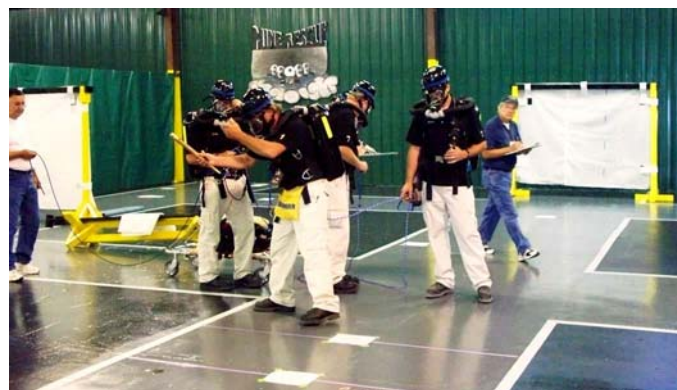
Figure 2. The indoor mine rescue contest practice field at Consol Energy's Buchanan Mine training facility.

Figure 2 shows the most unique feature in this facility – the indoor mine rescue twin practice fields that are each three entries wide and five entries deep and the coal blocks, painted on the floor, are 14 x 16 feet wide. This area is large enough to allow two teams to practice for contests simultaneously. Being able to utilize this field all year long and during bad weather creates an efficient training schedule.