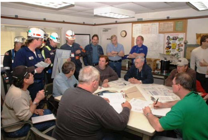
Figure 4. MERD incident command center exercise at the NIOSH Bruceton Coal Mine.

The SRCM is a conventional room-and-pillar operation approximately the size of a large working section of a coal mine and is utilized for mine health and safety research in areas such as ground control, ventilation, fires, emergency response, materials handling, communications, remote sensing and drilling, and environmental monitoring. This research mine also has a reversible fan, water hydrants, electric power, and compressed air. Although it is not publicly available for regular use, the real-life environment makes it an attractive place to conduct mine rescue and fire brigade training research including a variety of smoke-training exercises and mine emergency response development (MERD) drills. The MERD incident command center, shown in figure 4, is located next to the mine and includes communications and mine rescue team staging areas.