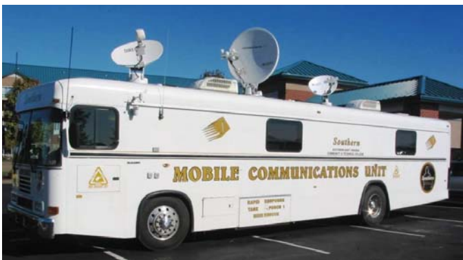
Figure 6. SWVCTC Mobile Communications Unit (Command 1) equipped with a multiple-satellite communication system.

SWVCTC places a heavy emphasis on incident command and mobilization of emergency assets and integrates this expertise into mine rescue training in the form of MERDs. This facility operates an on-call 24/7 fleet of five mine emergency response and support vehicles that is partly funded by the state of WV. Given the name Task Force 1, they are specially-designed to provide communications, rescue, and fire service to mines in very remote locations. Rescue equipment includes light towers, rescue jaws and cutters, 900-ton airlift bags, technical rope equipment for vertical rescue, self contained breathing apparatus (SCBA), portable power systems, and medical equipment. The Mobile Communications Unit (Command 1), shown in figure 6, is equipped with 12 computer workstations with fax/copy/scanner capabilities, a GPS and three satellite communication systems, MSHA-approved radio systems, a portable weather station, and helicopter landing-zone equipment. It can be used as an incident command center at any location that is accessible by a bus.