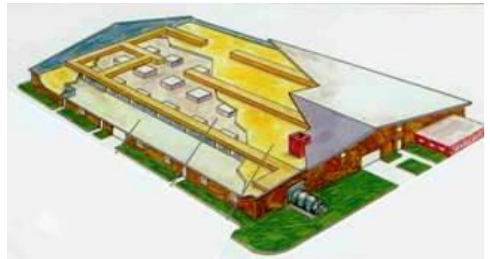
Figure 5. MSHA Mine Simulation Laboratory building cutaway.

The lower floor, shown in figure 5, simulates a typical room-and-pillar coal mine with four entries and nine crosscuts (4). The burn area includes an incombustible burn tunnel and concrete pads. Mine rescue training includes problem solving and first aid classroom courses, numerous outdoor fire-fighting drills, exploration and navigation in poor visibility, and other exercises where team members conduct hands-on mine rescue tasks including the construction of temporary and permanent ventilation controls while under apparatus. Other noteworthy features of this complex are dormitory space for 320 people, classrooms and laboratories that can accommodate 600 students, a cafeteria, library, auditorium, and wellness facilities.