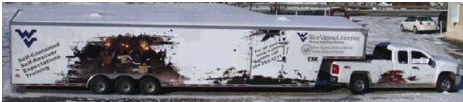
Figure 8. WVU Mining E&O's mobile unit (The Truck) for first responder training in a smoke maze.

Most of the first-responder training is conducted at mine sites for convenience to the mine operator. Two unique mobile training units are deployed to mines or remote locations. One specially-designed vehicle, named "The Truck" (figure 8), is equipped with a changeable 3-tiered smoke maze that is used to build confidence among miners while wearing SCSRs or SCBAs in confined-space drills. It consists of a series of movable partitions and swinging doors. The temperature and visibility can be adjusted to simulate the heat and smoke from a fire. Practical hands-on extinguisher and hose experience can be provided by the use of remotely-controlled fire pans in the mine yard.