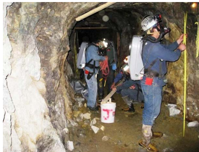
Figure 7. Edgar Mine MERD exercise showing teams building a ventilation control.

MERD exercises, using modified MSHA-approved rules, are offered that engage team members in realistic and hands-on training. In one example, participating teams rotate through three different situations: incident command center, underground mine rescue team, and back-up mine rescue team. Mine rescue teams work a realistic problem using both contest rules and procedures for a real-life emergency by navigating in smoke, building ventilation controls (figure 7), simulating fire fighting and hose management, performing first-aid procedures on real persons, solving problems and making decisions, utilizing back-up teams, and performing command-center duties. Incident command training gives team members a better understanding of the skills and knowledge needed for decision-making, the use of mine rescue team information, ventilation issues, and delays that take place during an underground mine rescue. Teams are also given a written test (one per team) to assess their skills and knowledge and then participate in a debriefing discussion at the end of the exercise.