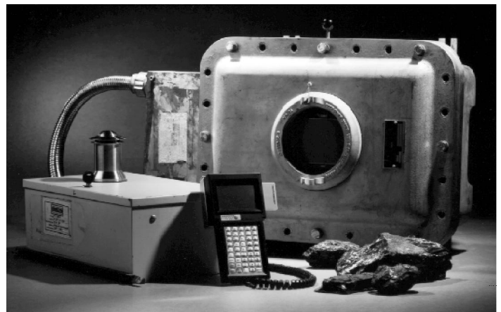
Figure 1.—Prototype preproduction monitor.

The Mine Safety and Health Administration plans to test 10 production versions of the MMCRDM in mines throughout the United States to help determine how best to use them to protect the health of miners.