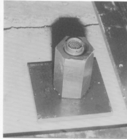
Instrumentation plug and installation head.