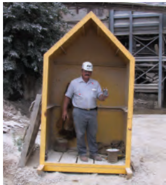
Figure 2. Blasting shelter used at a surface limestone mine in southwestern United States.

Figure 2 shows a blasting shelter used at a surface limestone mine in Southwestern USA. The shelter was constructed by the mine’s personnel. Another example of a blasting shelter used at a surface limestone mine in Ohio is shown in Figure 3 . The mining company requires that this type of blasting shelter be used for protection from a blast. The blast shelter is mounted on skids for ease of transportation and is constructed of steel that is 3/8-inch thick. The use of specially designed blasting shelters can provide the protection needed to prevent a person from being struck by flyrock. In the international sphere, a more sophisticated blast shelter has been designed by two Queensland, Australian inventors [Queensland Government Mining Journal, May 2001]. The shelter, which is cylindrical and constructed of 5/8-inch thick steel, is mounted on a rubber tired trailer.