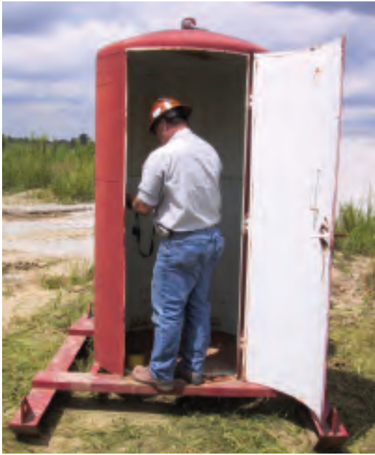
Figure 3. Blasting shelter at a surface limestone mine in Ohio.

Light buildings, pickup trucks, and other vehicles which are often used as covers, have been penetrated by flyrock [Schneider, 1996]. During a coal mine blast, a blaster positioned himself under a Ford 9000, 21/2-ton truck, and fired the shot. A piece of flyrock traveled about 750 ft and fatally injured the blaster under the truck [MSHA, 1992]. This accident could have been prevented by using an adequate blasting shelter. A safe location and sufficient cover is critical to a blaster's protection if the firing lines are not long enough to be beyond the flyrock range [Schneider, 1996]. Some blasting operations use a remote controlled firing system to permit blasters to stay out of the blast area.