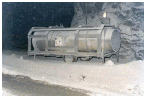
Figure 1. Jet fan.

The low pressure loss present in these large opening mines is actually an advantage compared to other type mines and should be treated as such. The ventilation principles, concepts and techniques used to ventilate these mines are different from the techniques used in mines with larger pressure losses. For example, axial vane fans have predominately been used where higher pressures are required. However, in large opening mines with low pressure requirements, propeller fans offer an alternative. The propeller fans can develop large air volumes under low pressure conditions. Propeller fans can be used as either main mine fans or as free standing auxiliary (jet) fans. Free-standing fans are commonly used to promote air movement as shown in Figure 1.