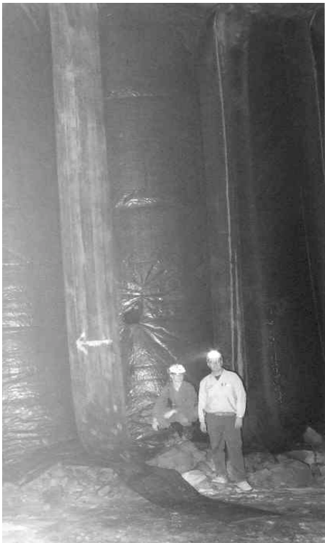
Figure 5. Used mine conveyor belt supplementing conventional mine brattice in a stopping.