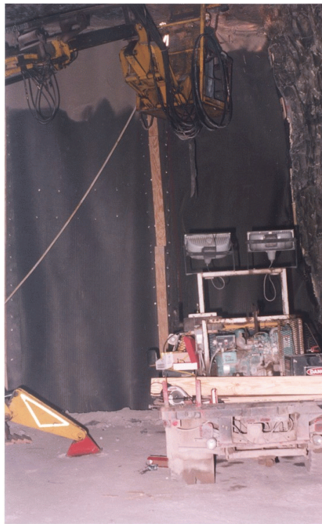
Figure 8. Fabric-grid material sprayed with cementitious material.

A prototype stopping being researched by NIOSH is a tension brattice stopping. The stopping is similar to the tension membrane construction methods used to create various fabric covered, large dome stadiums throughout the country. In this stopping, currently being installed and tested at NIOSH's Lake Lynn Laboratory, a brattice material is tensioned and attached to the various steel framework supports, thereby increasing the strength of the structure.