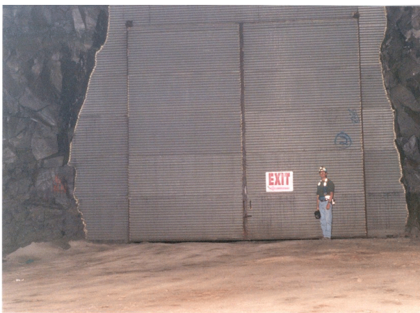
Figure 7. Stopping made for corrugated steel panels reinforced with a steel frame.