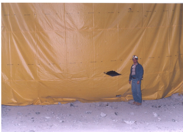
Figure 6. Fly rock damage in brattice cloth.

A less elaborate, but still rigid, stopping is a fiber/mesh covered with cementitious grout as shown in Figure 8. This type of stopping is currently being evaluated in an operating underground limestone mine. This stopping is installed by hanging fabric backed by grid and then sealed by spraying with a water-based cementitious grout on both sides using high pressure grout pumps. Stoppings of this type are still being evaluated for effectiveness by NIOSH researchers.