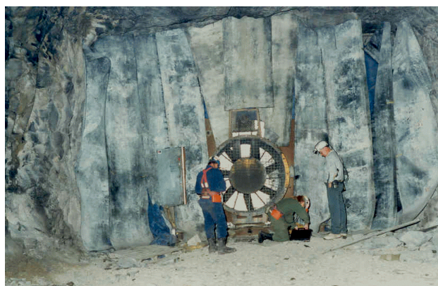
Figure 4. Used mine belt used pressure relief.

Used conveyor belting that is no longer useful for material transport can be used to make stoppings. The combination of used belting and brattice have been used effectively in stoppings for both sealing, production face shot relief, and flyrock or other physical damage protection. It has been successfully used as blast relief in a main mine fan bulkhead. Prior to utilizing the mine belt as shown in Figure 4, the mine had several stoppings blown over during production face shots. The mine belt weight and strength allow it to be strong enough to withstand the pressure wave from the face shot but flexible enough to give and act as a pressure relief. Belting hung in this manner should be hung in an overlapping concave pattern to promote interlocking of belting. This technique will minimize air leakage. Figure 5 shows used mine conveyor belt supplementing conventional mine brattice in a stopping. This combination minimizes leakage while providing protection, blast relief, and a more substantial stopping. Conveyor belts could also be used to shield conventional brattice stoppings from the fly rock damage shown in Figure 6.