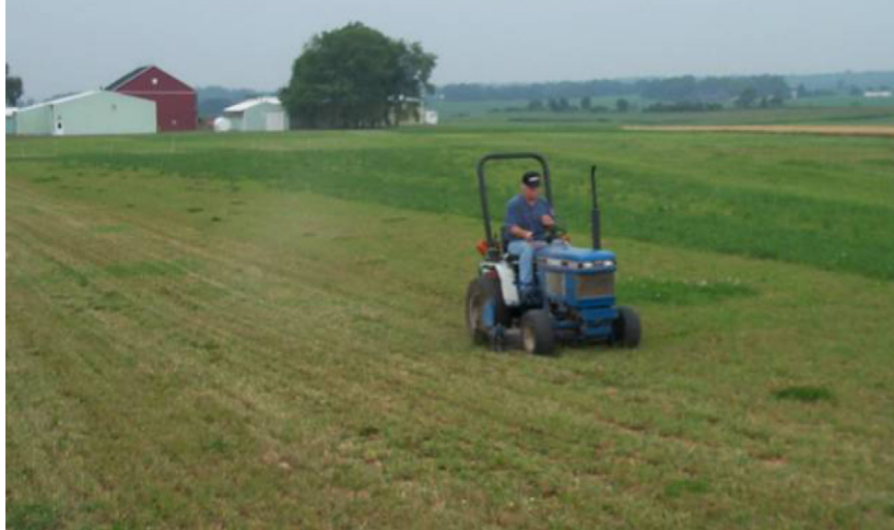
Fig. 7. Class 1 utility tractor mowing a field.