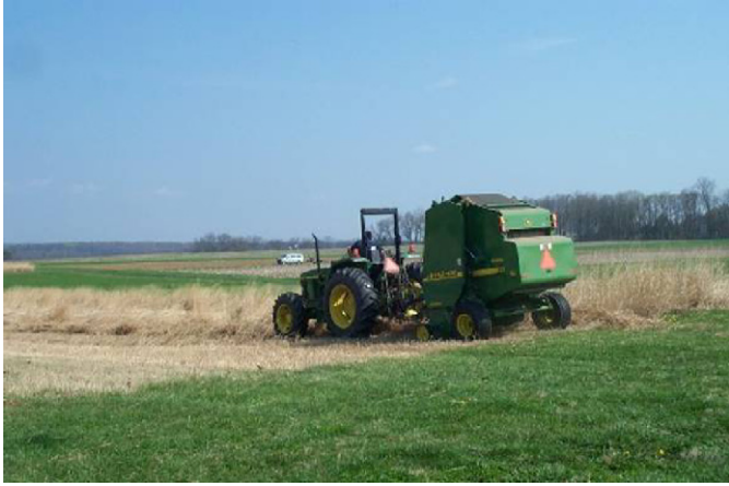
Fig. 1. Class 2 tractor baling hay.