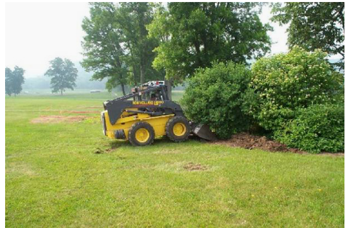
Fig. 6. Skid steer loader during shrub removal operation.

The field data analysis showed vehicle operators experienced peak vertical accelerations—indicative of jars/jolts—that could reach accelerations as high as 3.4g 's. This particular event occurred at the transition of two road surfaces with the vehicle traveling at a relatively higher rate of speed. A power spectral density analysis of the data reveals that this g -level corresponded to a frequency lower than the sensitivity range of the seated human body (4–8 Hz). Potentially, this magnitude could be problematic, but it is unclear to what degree that it would be. How often such events occur for the type and class of vehicle is important to note when evaluating operator exposure, severity of exposure, and needed isolation for the seat and possibly other operator cab components. The authors observed that these occurrences were not frequent during data collection. However, owing to the complexities