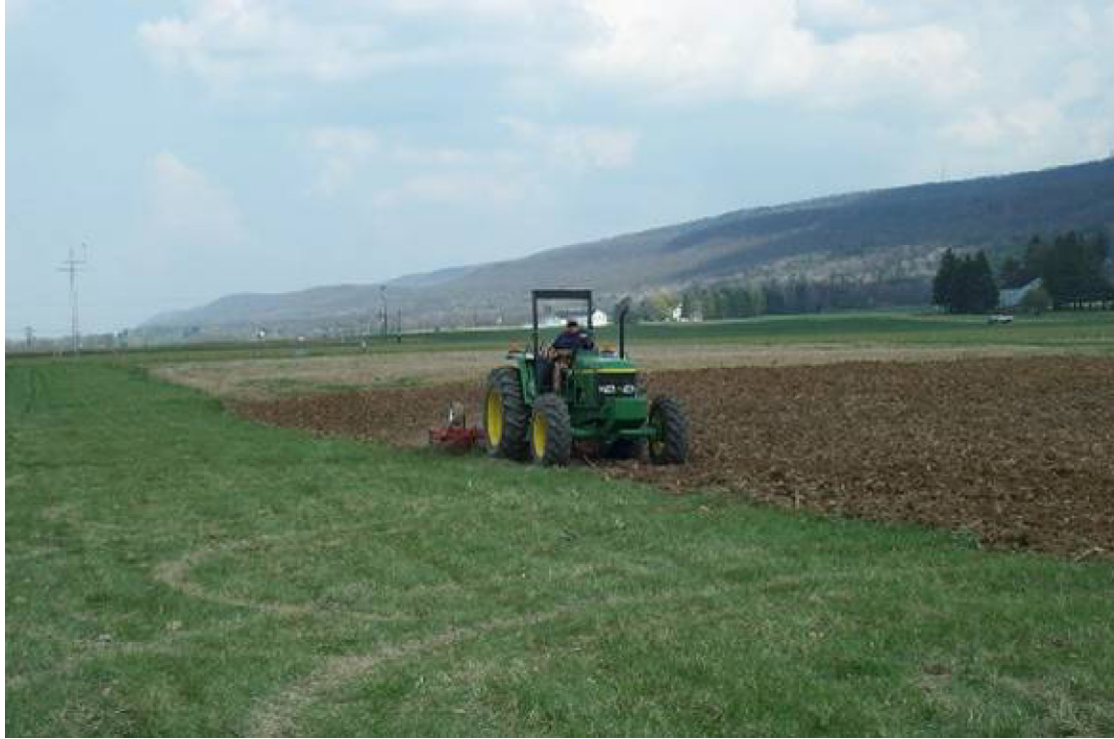
Fig. 3. Class 2 tractor tilling a field.