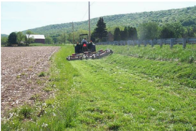
Fig. 2. Class 2 tractor mowing a field.