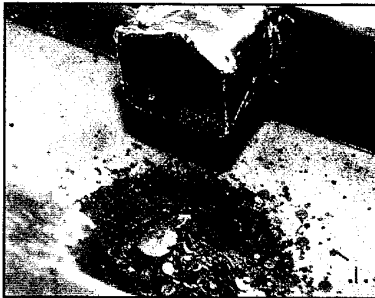
Fig. 1. The cut end of a filled plow frame section (4x4x142 in.) and the contained metal scrap.

NIOSH, the U.S. government agency charged with conducting research aimed at preventing work-related injury and illness, investigated two such incidents that occurred