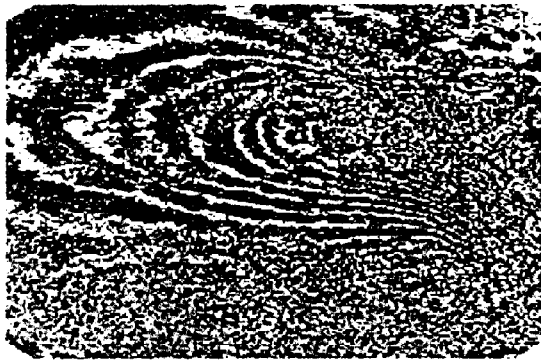
Figure 4 -- Interferogram of earth displacements along a fault.

IFSAR has also been used to measure sea ice movement in Antarctica (Goldstein et al., 1993), model ocean wave patterns,