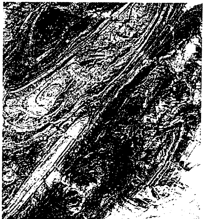
Figure 5 -- Spectrometer image.

The need for geologic mapping of mine areas needs to be improved. The design of mine slopes, the placement of waste dumps, tailings dams, mine roads, etc. is based on geologic maps that show the location, attitude, and character of geologic structures and ore-bearing rock units. However, mine maps can vary greatly in quality and detail due to the subjectivity of various geologists, and the extreme geologic complexity of many deposits. In addition, there are financial and practical limits to the number of geotechnical samples that can be taken for analysis and engineering purposes, so much of the data shown on geologic maps is an estimation by a geologist or a mathematical interpolation of geotechnical results. Figure 5 is a spectrometer image clearly delineating fault areas, folds, and numerous rock types.