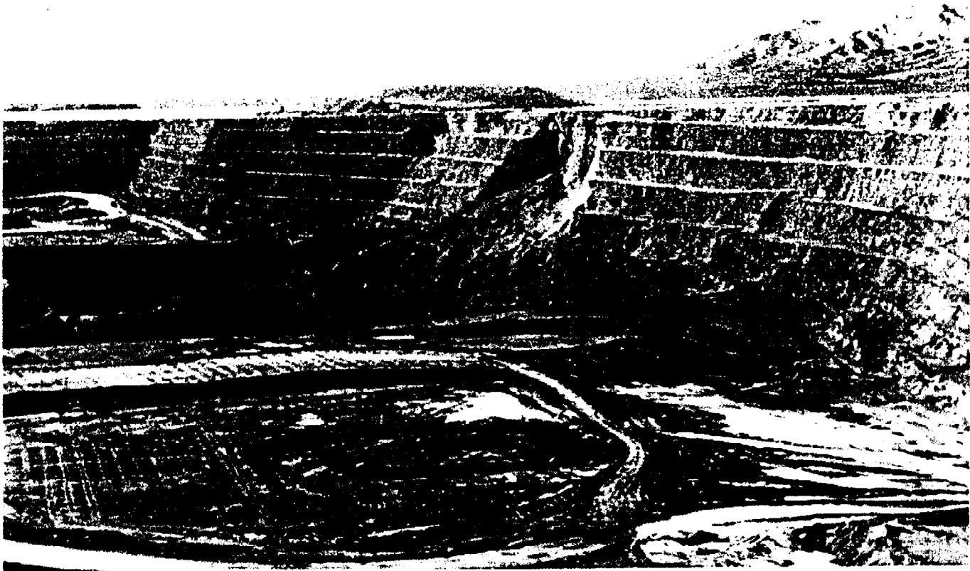
Figure 1 -- Massive slope failure in the highwall of an open pit mine.

while geotechnical designs can be improved to increase factor of safety, and support systems can enhance the overall rock mass strength, even a carefully designed slope may be subject to instability. The objective of this paper is to briefly introduce the most common slope monitoring systems currently in use, describe the limitations of these systems, and present new remote sensing technologies that may be applicable to advanced monitoring and design of dumps, highwalls, tailings dams, and other slopes.