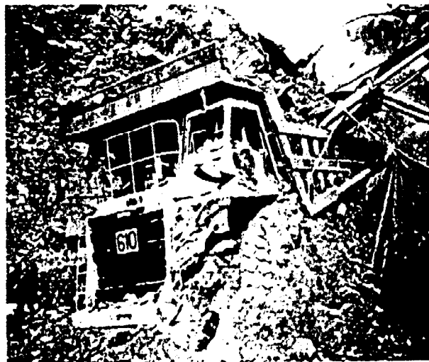
Figure 2 -- Unexpected slope failures endanger lives and demolish equipment.

loading, pore pressure effects, and many other factors can cause instability even in a "safe" slope. The fact that a slope is designed with some risk of failure must not be viewed as a disregard for safety. As long as the risks are known, and a sufficient, suitable monitoring system is provided, remedial engineering and safety measures can be taken (Call and Savely, 1990).