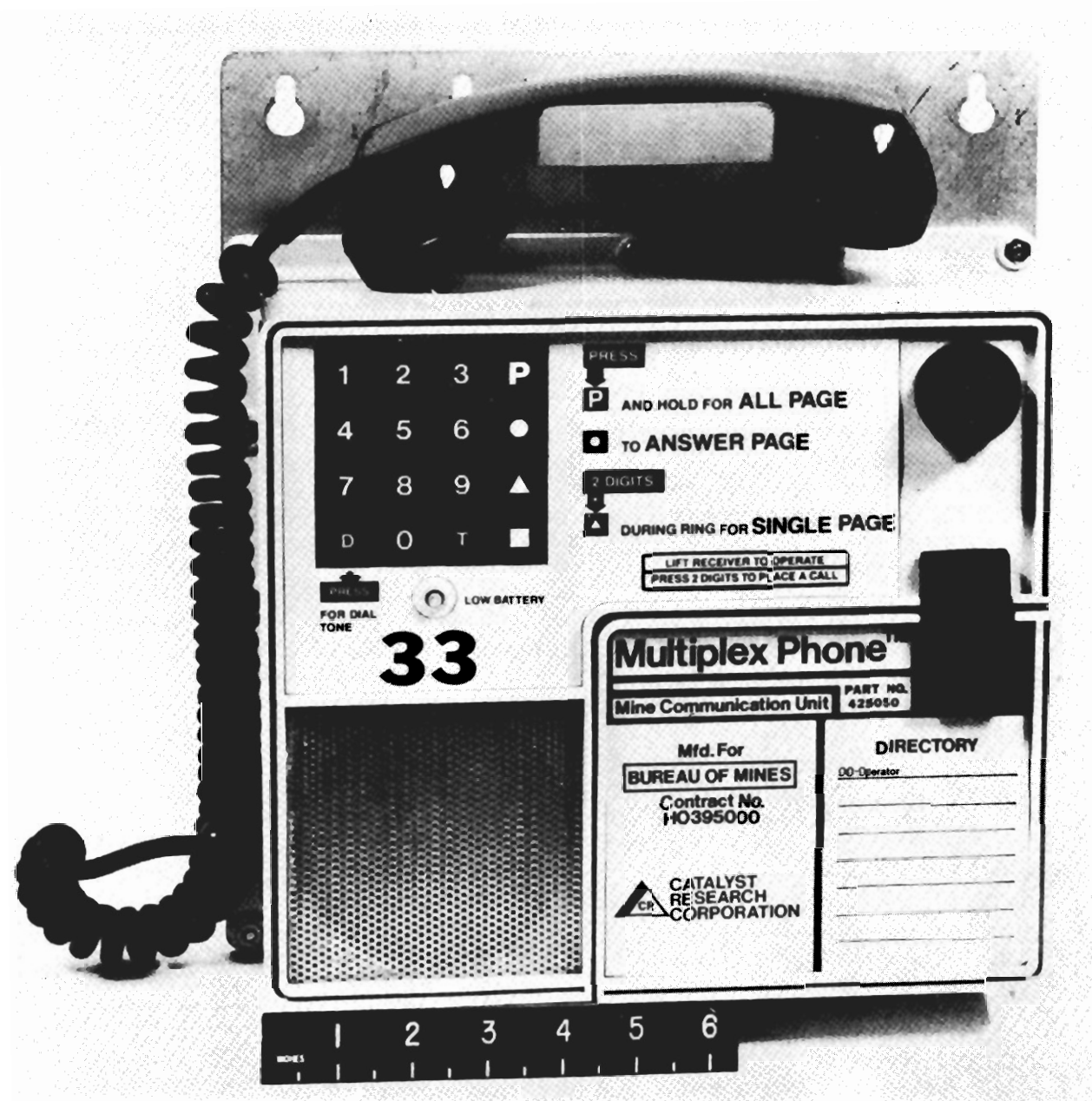
FIGURE 2. - Multiplex Phone