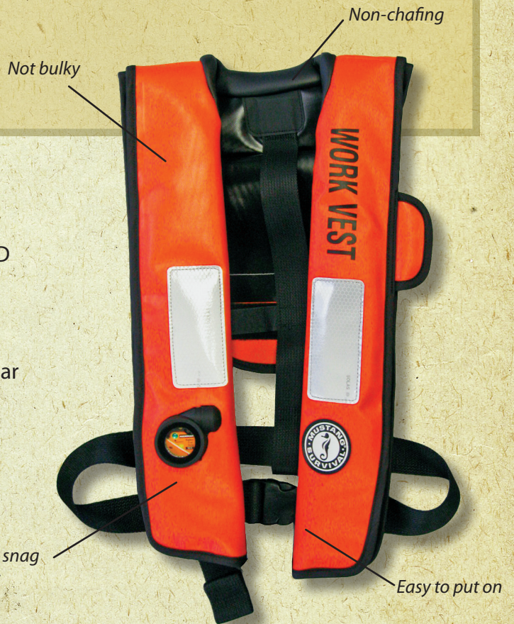
Mustang Inflatable Suspenders (MD3188)