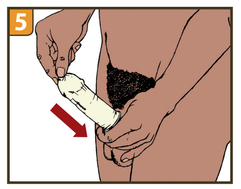
Unroll the condom all the way down the penis.