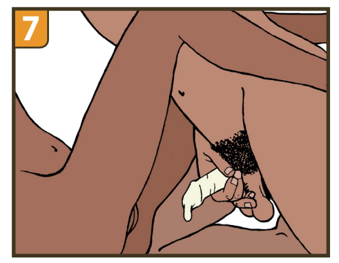
After sex, the survivor should hold condom on the bottom of the penis and pull out of the vagina.