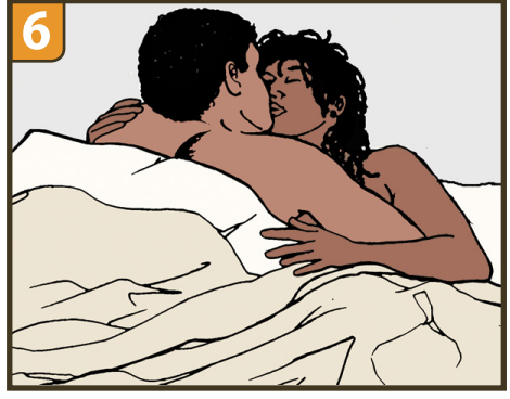
Use a condom every time you have sex.