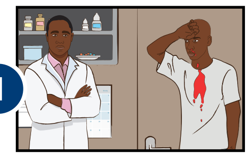
Fever and bleeding.