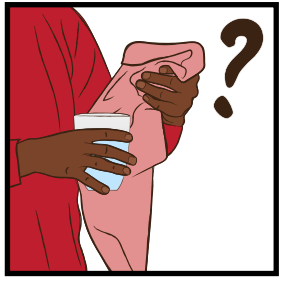
Contact with personal items of a sick or dead person?