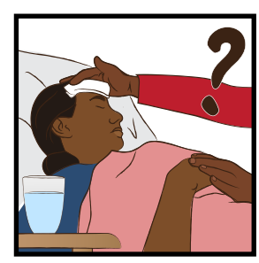
Contact with a sick or dead person?