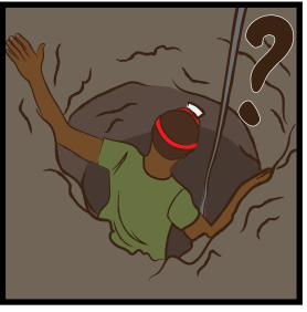
Work in a mine?