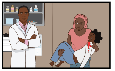
Unexplained bleeding and death.