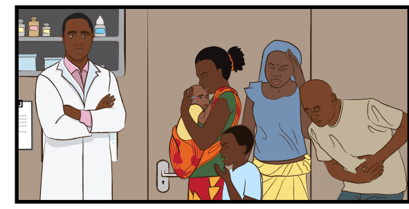
Several seriously ill patients from the same family or social group.