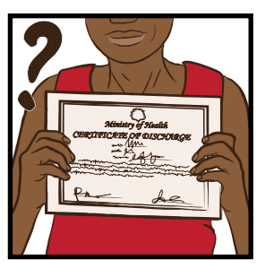
Recovered from Ebola in the past?